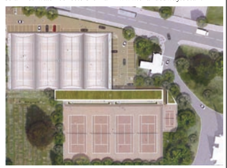
An aerial view of the proposed tennis club.

Residents will be able to view the plans in January 2012 probably at the same venue, and can view some details on www.chandosway.co.uk.