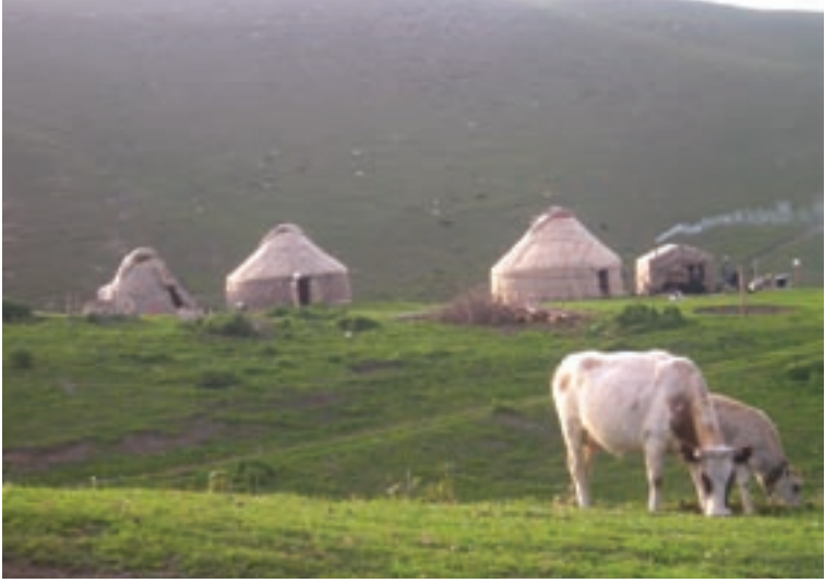
A long way from N2: yurts near China's border with Kazakhstan.

used for crop testing and, in the distance, a small (but unfortunately polluted) lake. Our flat had basic facilities but, being tiled throughout, was bitterly cold in winter.