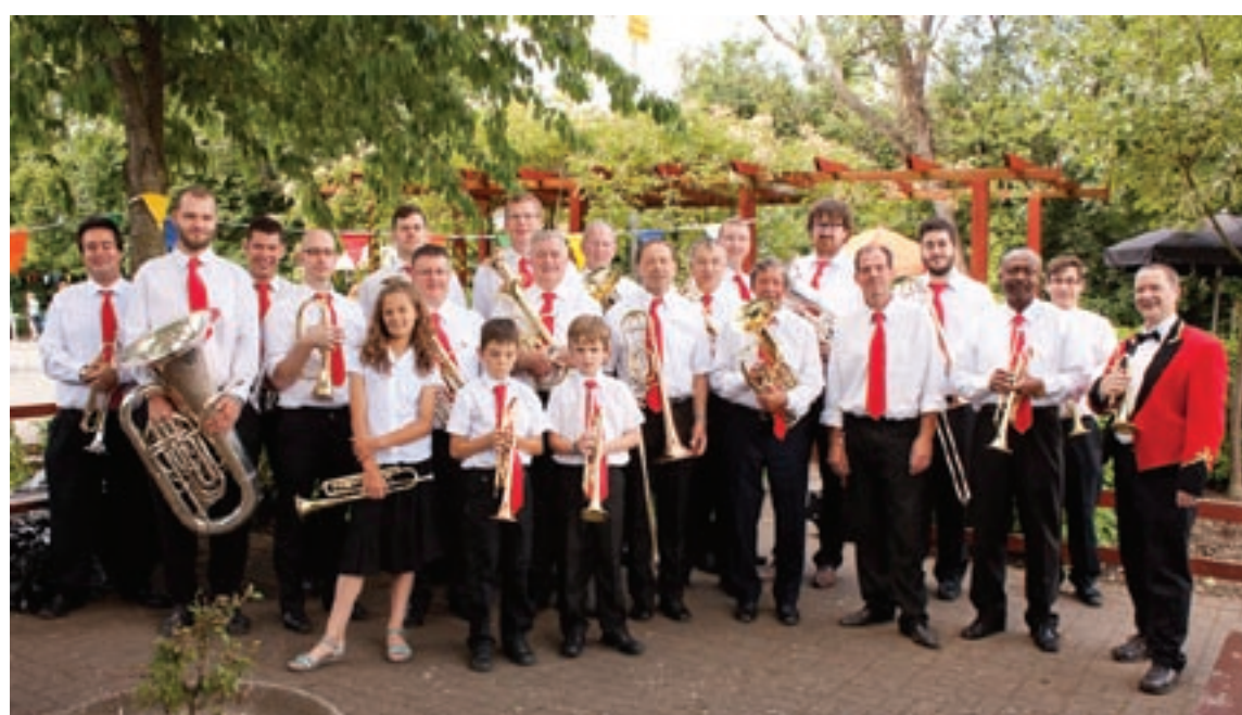
Muswell Hill Brass Band.

There were plenty of activities, from maypole dancing