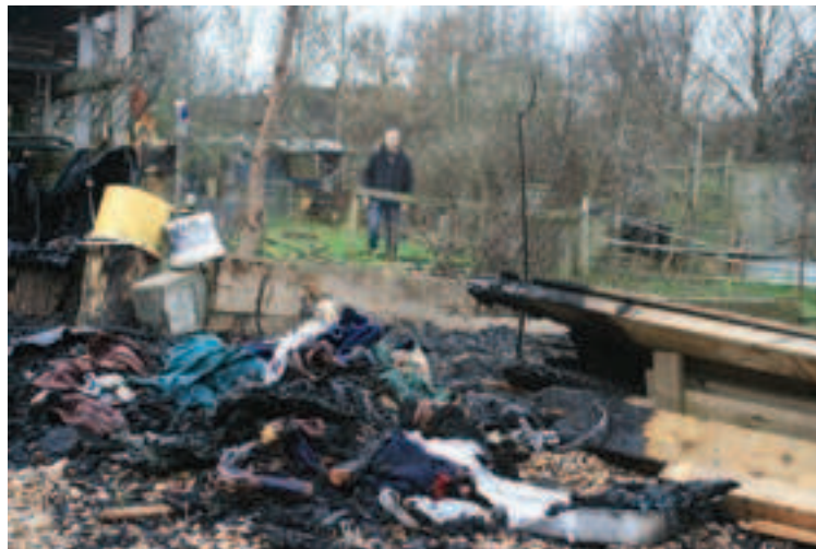
One of the burnt-out sheds at Vale Farm Allotments.