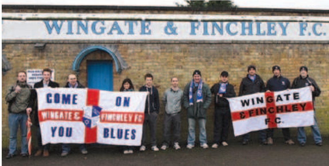
The charity walkers set out to walk to the match.