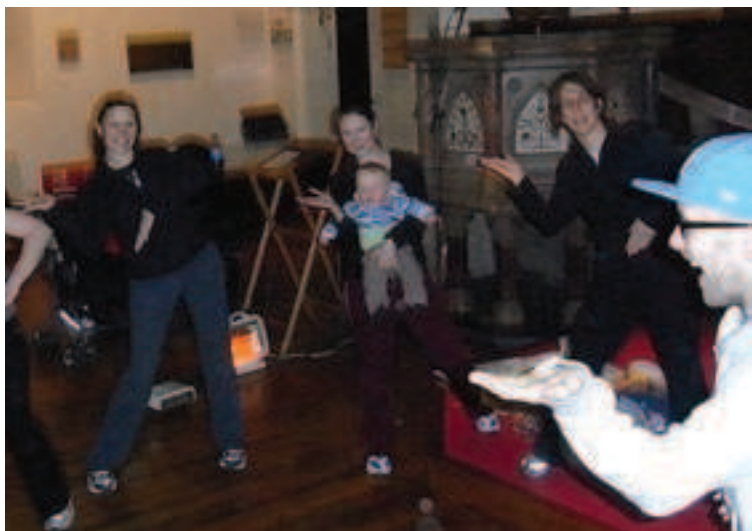
An active Zumba class underway