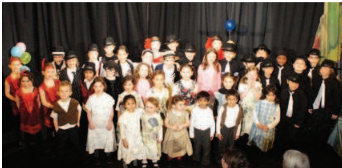
The cast of Wind in the Willows , another hit for Create.

Distribution takes place once a month. A typical round takes 30-45 mins to deliver. For details contact 020 8883 0433 or the-archer@lineone.net