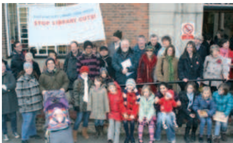
Protesters say a well-used library like East Finchley's should not be threatened by cuts.

See the public opinion on page 4, and Letters on page 11.