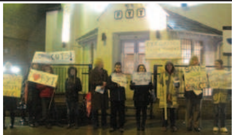
Protesters make their voices heard outside the threatened Finchley Youth Theatre.

On 29 March a report is due on Barnet's library consultation, with branch closures a likely outcome. To be kept informed of events, protests and plans join the EFLUG mailing list via pollynapper@btinternet.com or join East Finchley Library Users Group at www.eflug.org.uk . A video of the protest is at www.youtube.com/watch?v=EesyEdIxxXE .