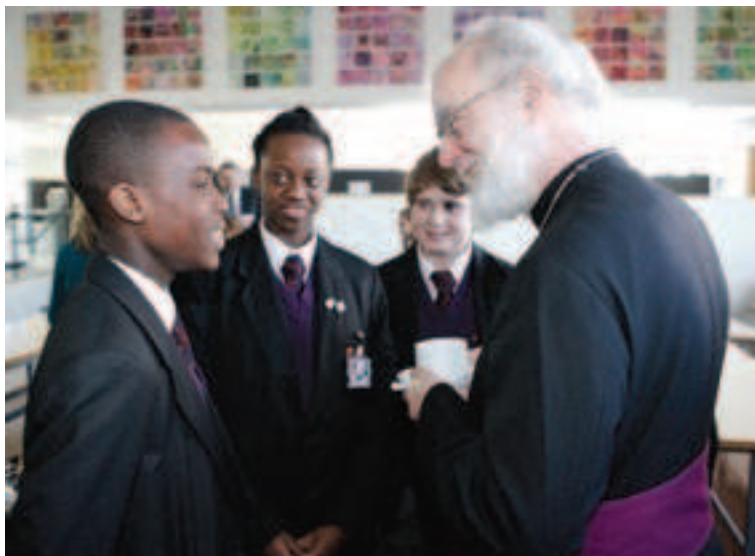
The Archbishop of Canterbury spent time talking to pupils during his visit.

Wren Academy is sponsored by the London Diocesan Board for Schools (LDBS) and Berkhamsted School (a leading independent school). The Academy's new buildings project was completed in the summer of 2010 at a cost of £23.4 million.