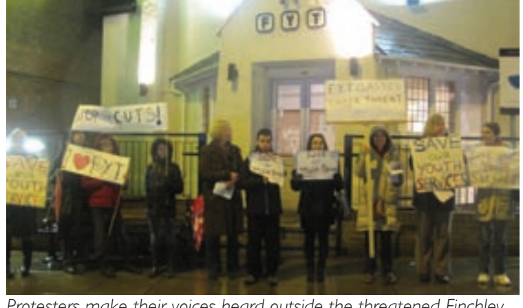
Protesters make their voices heard outside the threatened Finchlev Youth Theatre.