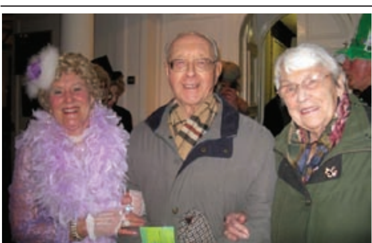
Visitors enjoyed the old time singalong.