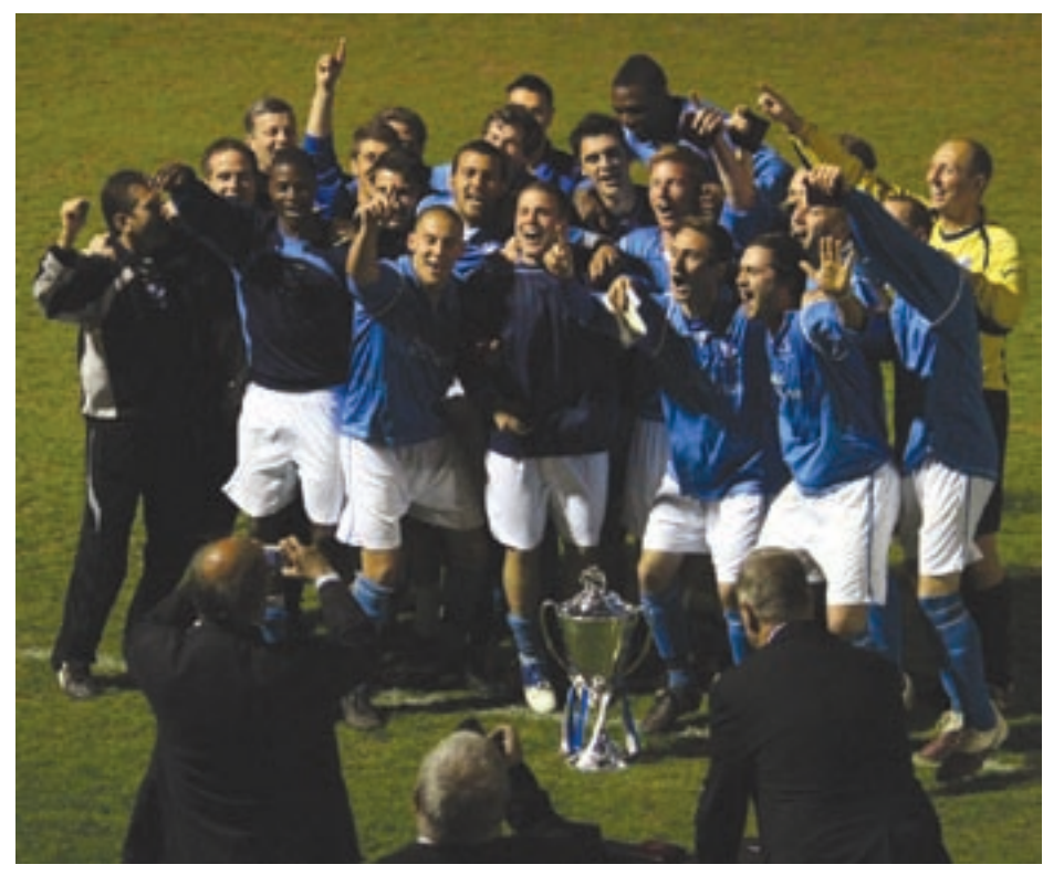
Wingate & Finchley celebrate their cup win.