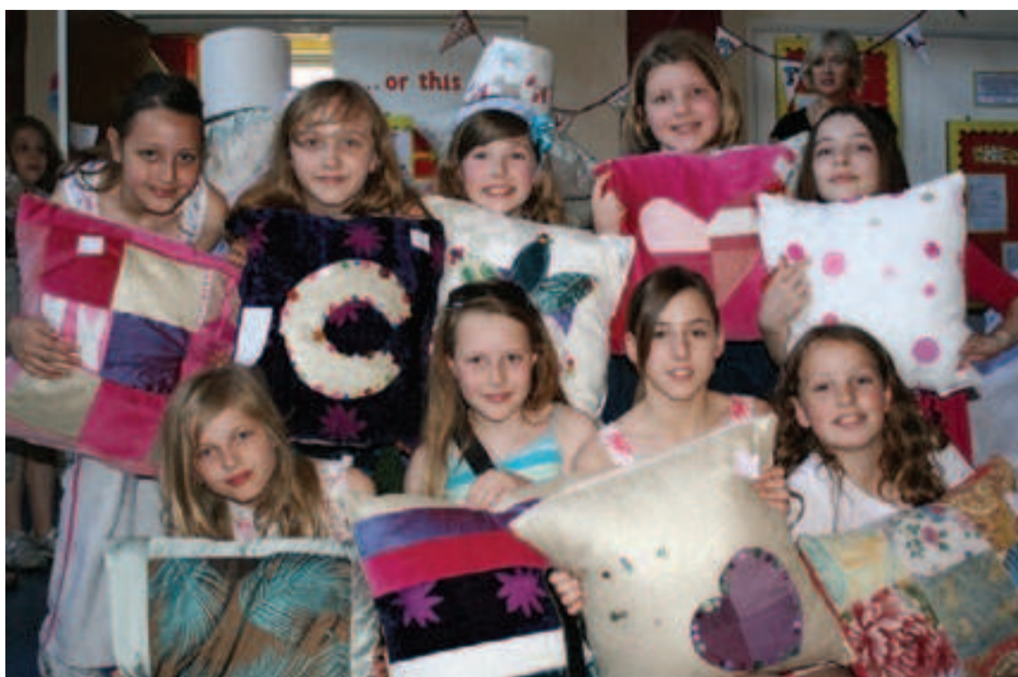
Cushy: the Year 6 girls from Holy Trinity School with their best-selling cushions.

East Finchley Electrical Contractors ▪ 115 High Road, East Finchley N2 8AG