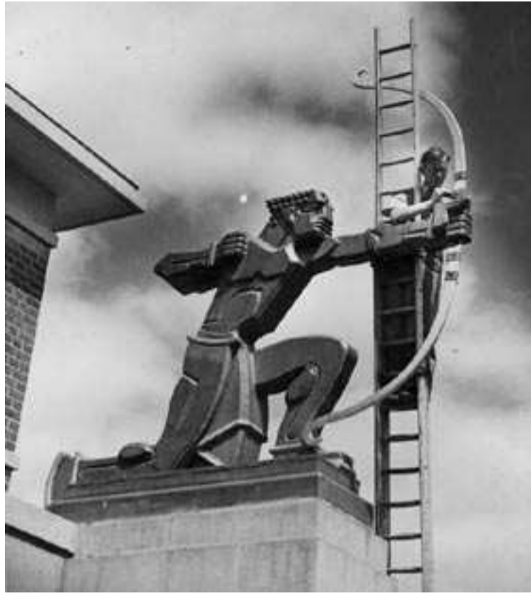
Eric Aumonier with Archie in 1940.

Eric: Archie, you have to face facts. The 2012 planners have spent vast sums on creating