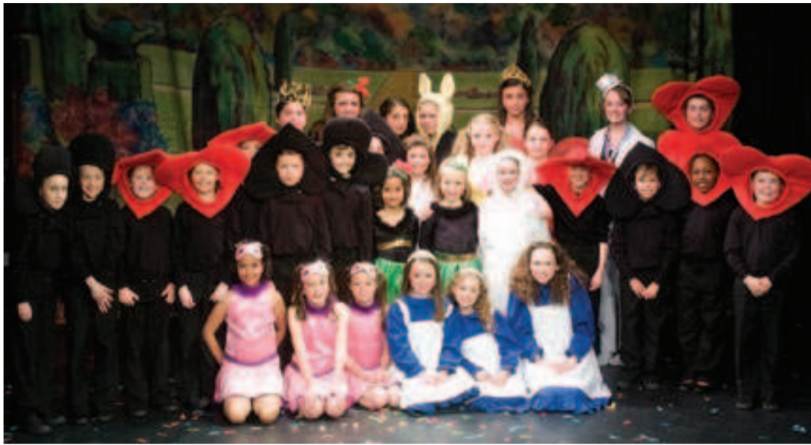
A very important date: the cast of Create's Alice in Wonderland

The Create Theatre School scored another hit on the 8 and 9 May with its 2010 production Alice in Wonderland at the newly refurbished Finchley Youth Theatre, raising £250 for the Bobath Centre.