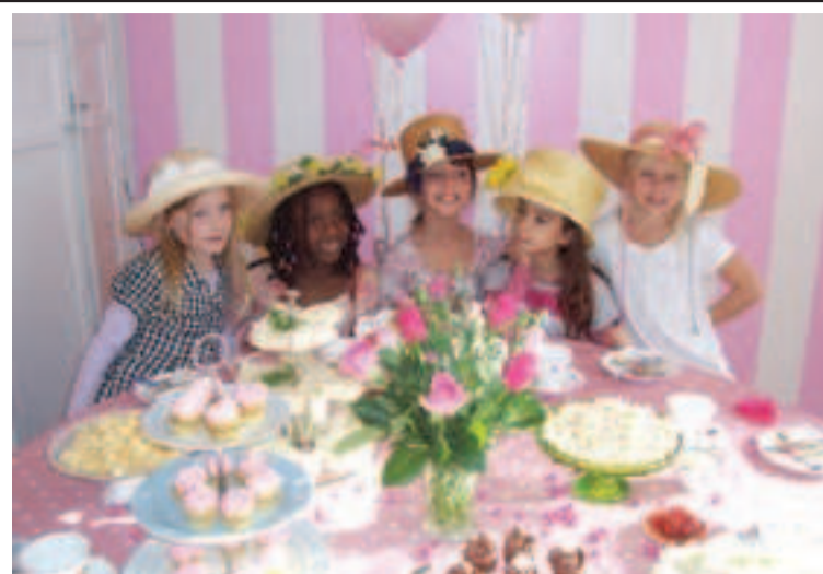
All set for a special party.