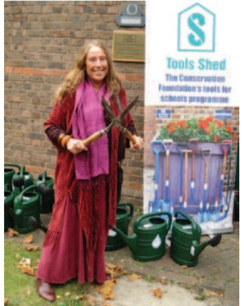
Ready for Action.

A request to bring a group of well-behaved young members of Muswell Hill's Hollickwood School Gardening Club, many of whom "have never actually SEEN a garden" to visit our garden led us on a series of unimagined adventures.