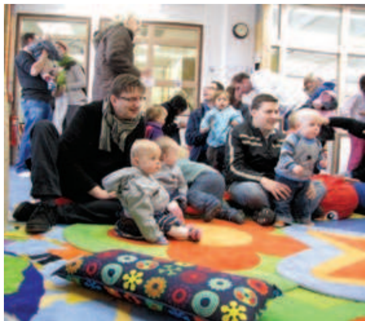
Enjoying Dads' Day.

A busy few weeks in the Highgate Children's Centre culminated in early May with a very successful Dads' Day event. The rain threatened but just about held off and 80 local families, including many of the dads and toddlers from the regular Wednesday morning Dads' Club, braved the dark clouds and the cold to come along.