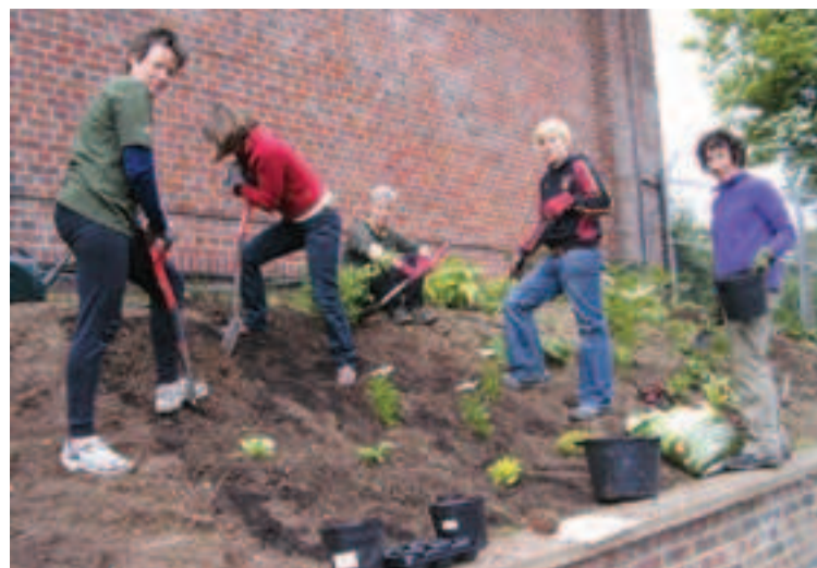
Three female firefighters and two N2 gardeners on site.

For more information on any of the classes and activities at Highgate Children's Centre please drop in to the centre at Gaskell Road (off North Hill) in Highgate N6, or call 020 3213 0004.