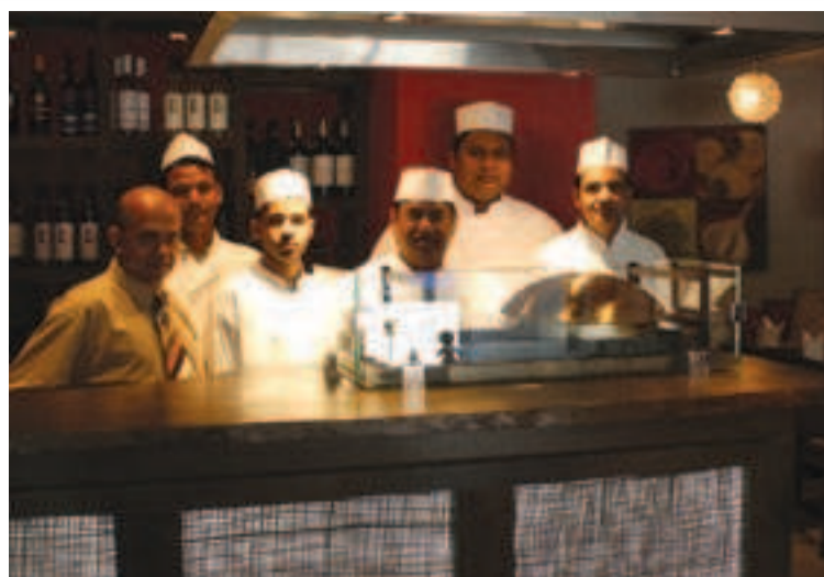
Chefs and staff in the new bar area at the redesigned Cochin restaurant.

Finally, whilst we are closed we will be taking bookings for the 2010-11 New York Met Opera season. Details are on our website. So we'll be bringing you films you can't miss in a cinema you just have to see. Our box office is on 020 8444 6789 or visit www.phoenixcinema.co.uk