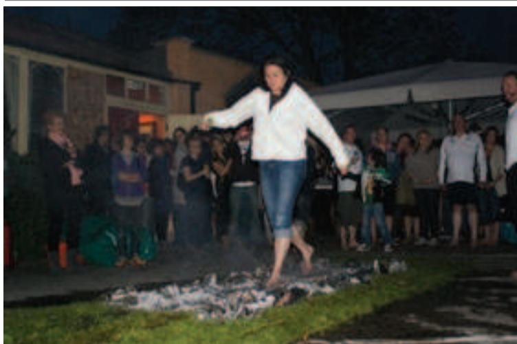
Too dam hot: a firewalker braves the hot embers at the Five Bells.

A community newspaper for East Finchley run entirely by volunteers.