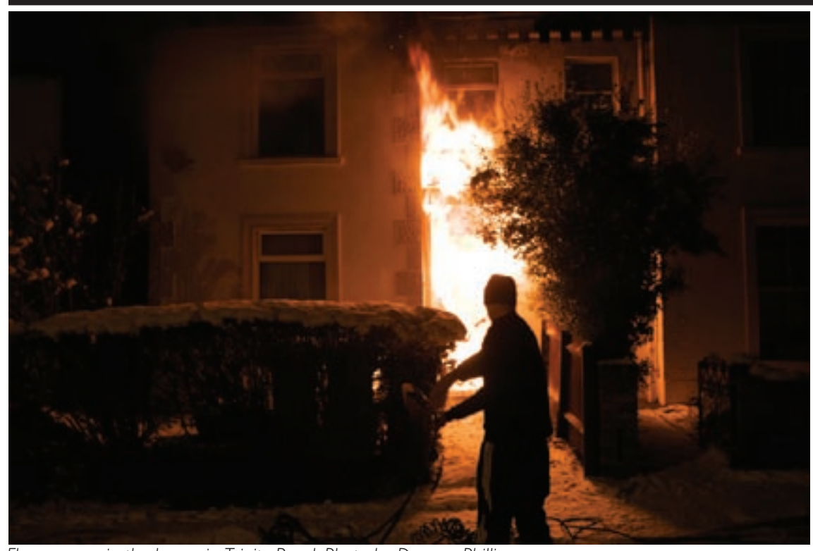
Flames rage in the house in Trinity Road.

A community newspaper for East Finchley run entirely by volunteers.