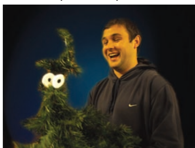
A scene from Catching Father Christmas, coming to artsdepot.

Do you fancy a family outing to the theatre to catch a bit of Christmas magic? We have tickets to give away for Catching Father Christmas, which runs at artsdepot in North Finchley until 2 January.