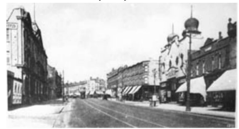
The Phoenix (then The Coliseum) in 1930.

Our own and much loved Phoenix Cinema is asking people to share their memories of the picture house and be part of their new Story Book Project which celebrates the cinema's centenary this year.