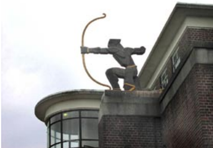
The Archer statue on top of East Finchley tube station.

Do any of THE ARCHER's readers remember this day? Please let us know. Our contact details are on page 2.