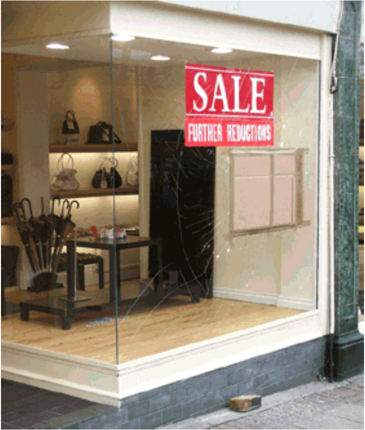
Kokos' broken window.

72 High Road was damaged by a brick on 13 January. Fortunately, nothing was taken, though whether this was because the resulting hole was too high or too small can only be guessed at. However, the perpetrators may well have been put off as the goods on show are firmly secured and there are surveillance cameras in constant operation.