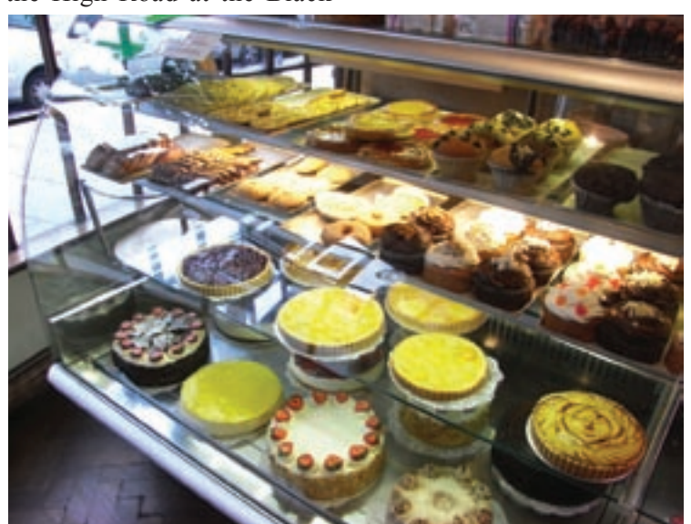
Decisions, decisions in Chorak by Sylvie Clarke is April's picture in our 2010 calendar.

Turn to page 15 and use our form to order by post. Send us your name and address, along with payment, and the calendar will be delivered straight to your door. Delivery is free.