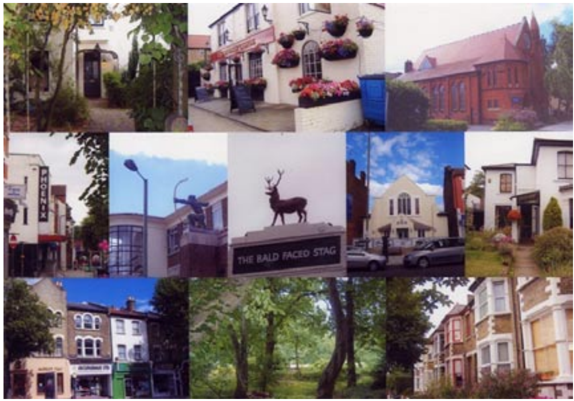
Gail Steiner's winning montage "East Finchley – the Place to Live"