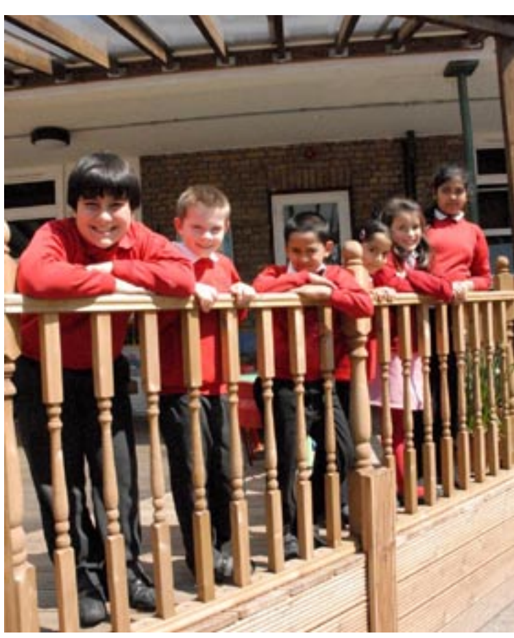
Manorside children are all smiles at their school's Ofsted report.

Another example cited was when Year 6 pupils recently worked with a scientist in exploring the 'fitness for purpose' of everyday objects such as sliding doors.