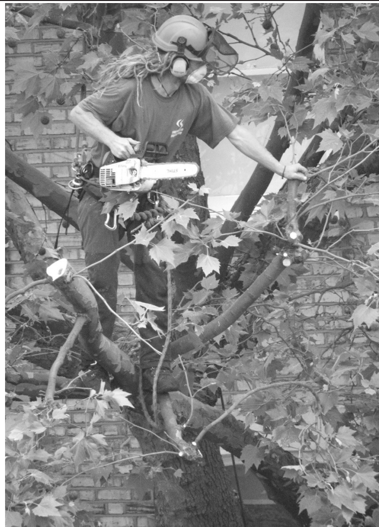
Pollarding trees in the High Road.

We were lucky this time, and the bad weather since then has kept people from making fires. Next time we might not be so lucky. With all the people who tried to get back a park keeper and have written to THE ARCHER about the state of the wood, I think it's time Barnet Council got on with putting the community first.