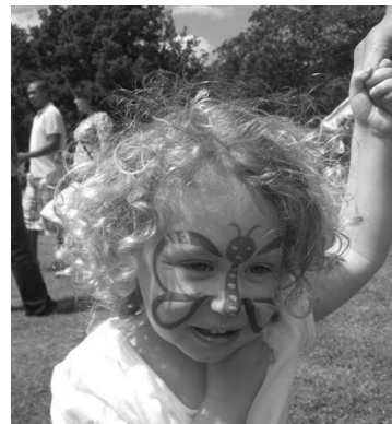
Painted face