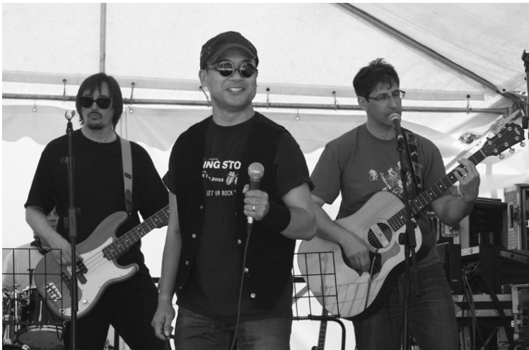
Musical treats on the main stage.