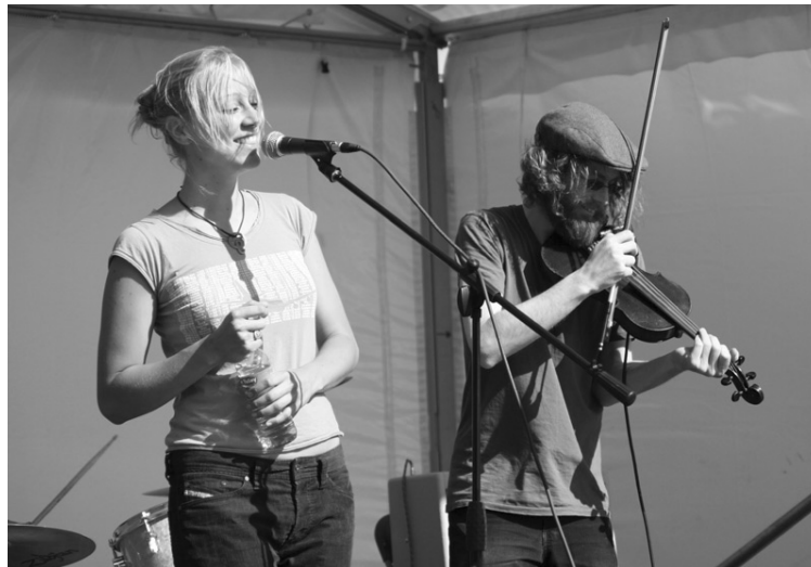
Folk music on the community stage.