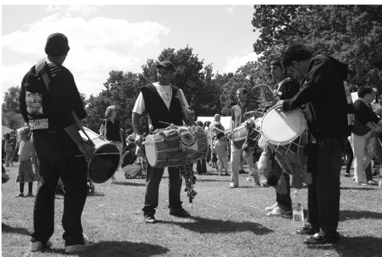
Dhoom Foundation entertain the crowds.