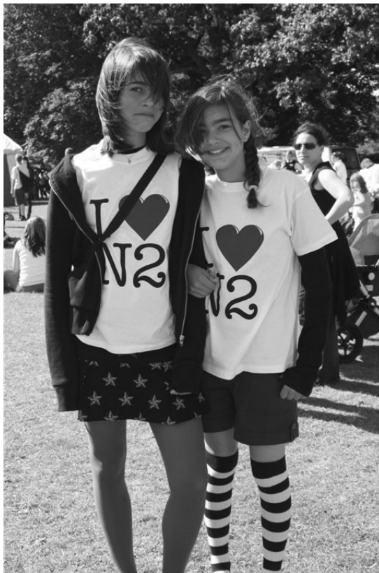
Enjoying the festival above and above right