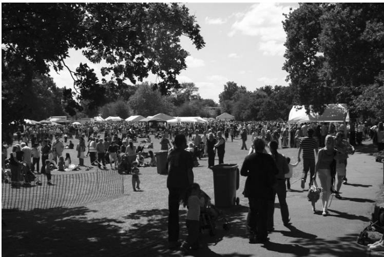
Like Glastonbury but without the rain.