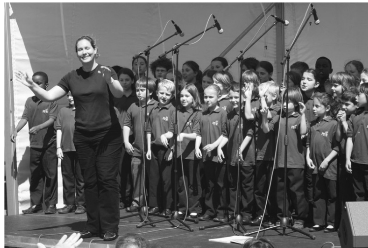
Finchley Childrens Music Group.

Our photographers were there to capture the atmosphere. Here's to next year's festival.