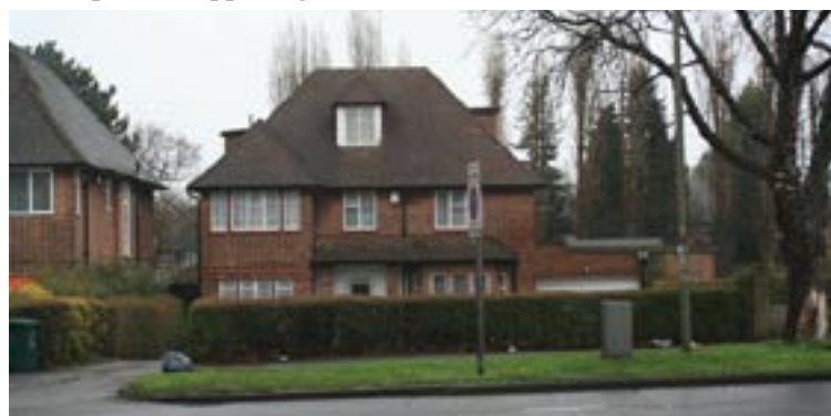
Five flats are to be built on the land in Aylmer Road where one house currently stands.

A Barnet Council spokesman said: "The planning application for Aylmer Road was approved by councillors at the planning committee in January in accordance with planning guidance. Careful consideration was given to the views expressed by residents throughout the decision making process."