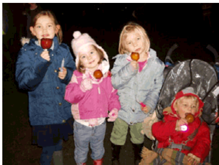
Children munching on toffee apples at the fabulous Martin Primary School Fireworks Display.

Large crowds gathered in Martin Primary School field on Thursday 6 November, eagerly awaiting what turned out to be a breathtakingly beautiful firework display.