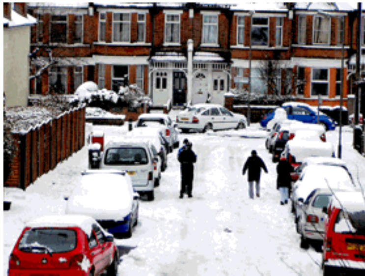
Snowball fights in Sedgemere Avenue.