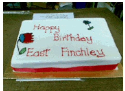
East Finchley Library's birthday cake, made by a member of staff.

Since its opening, our landmark building has survived the Second World War and Barnet's proposed resiting of the library within a Waitrose store