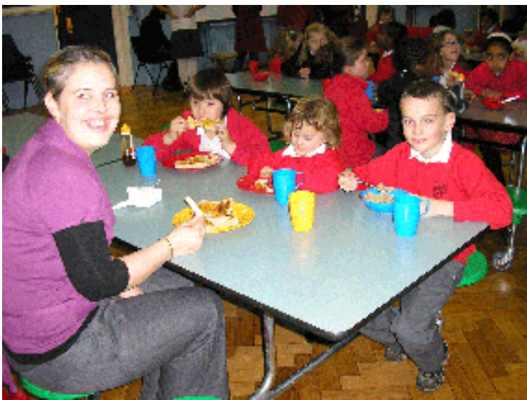
Teachers and children enjoy a healthy start to the day at Manorside's breakfast club.