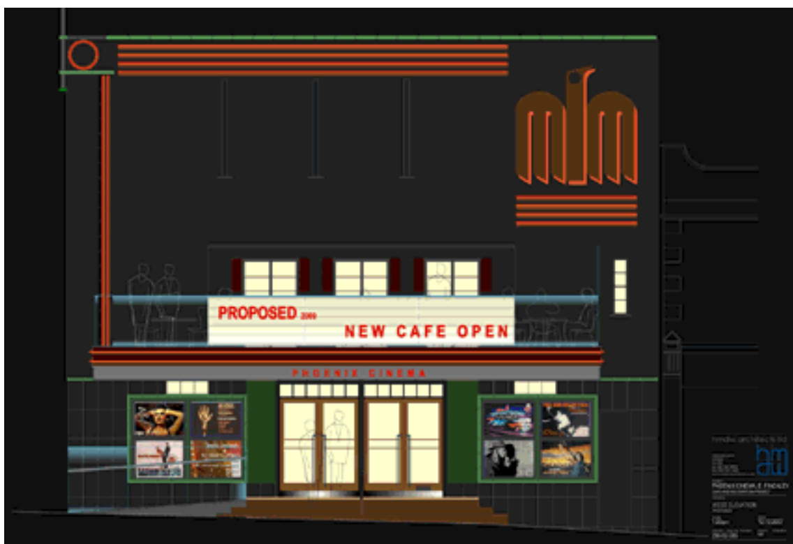
Architects' drawings showing how the front (above) and side (below left) of the Phoenix could look by 2010.