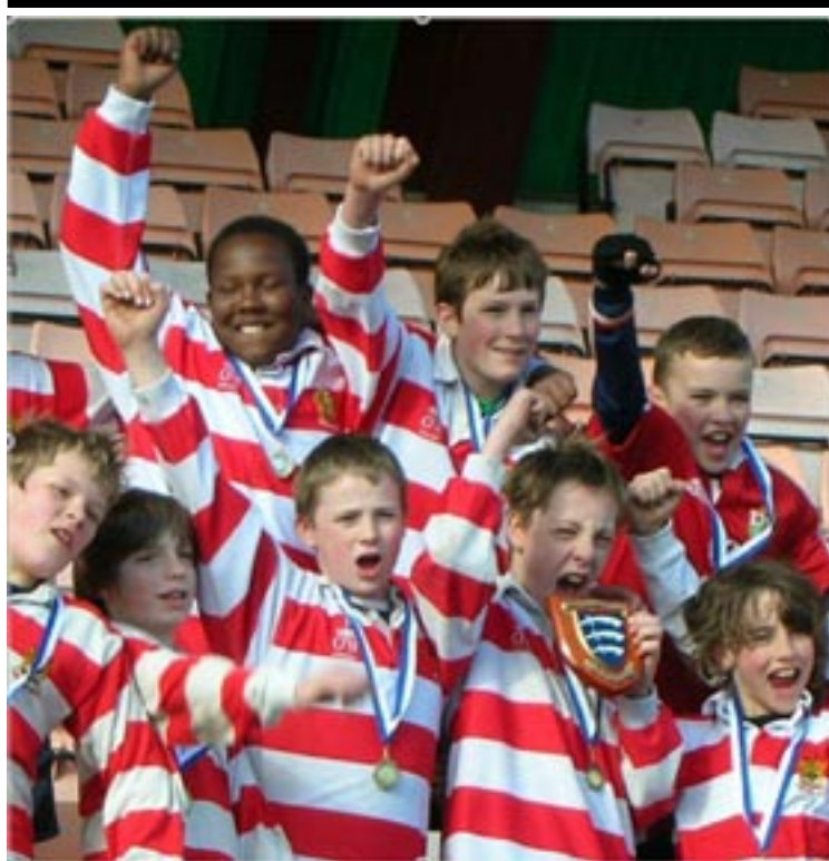
The Under 12 team celebrating winning the Middlesex Shield in March.