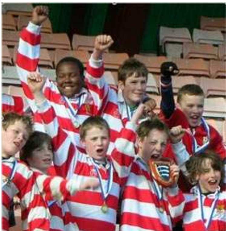
The Under 12 team celebrating winning the Middlesex Shield in March.