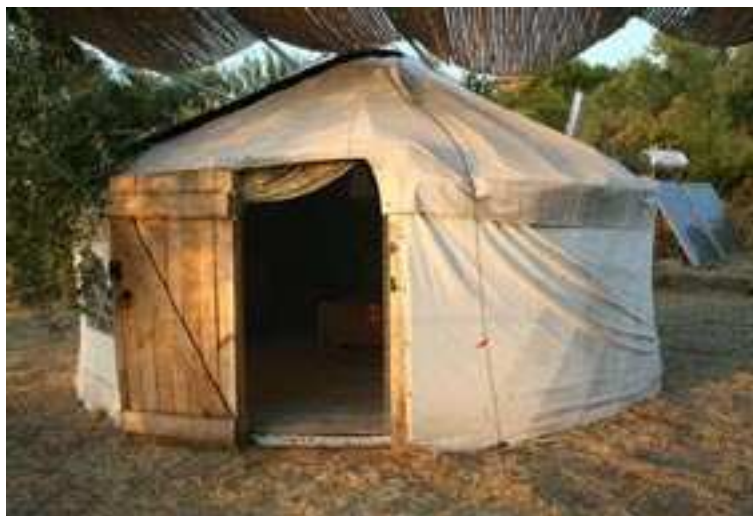
Sallie's yurt.

The neighbours were unbelievably welcoming, feeding me most nights and constantly arriving with eggs, chickens and excess vegetables. Before