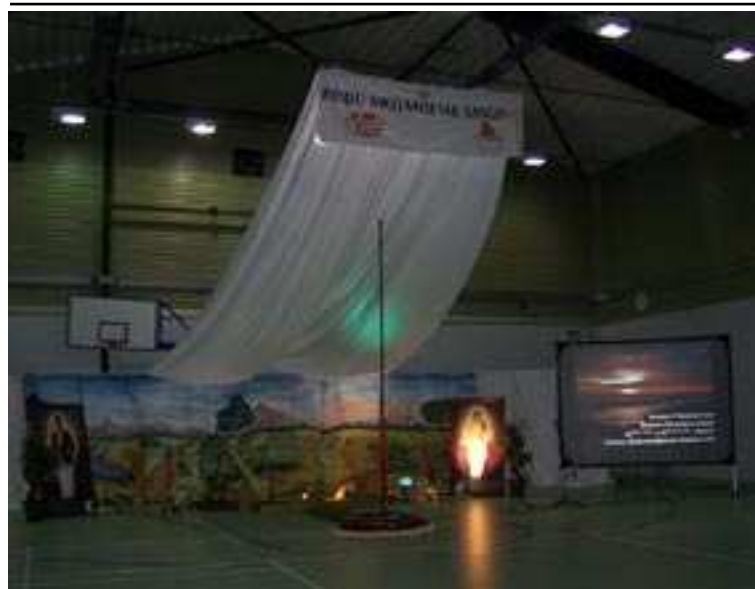
Bishop Douglass School sports hall transformed.