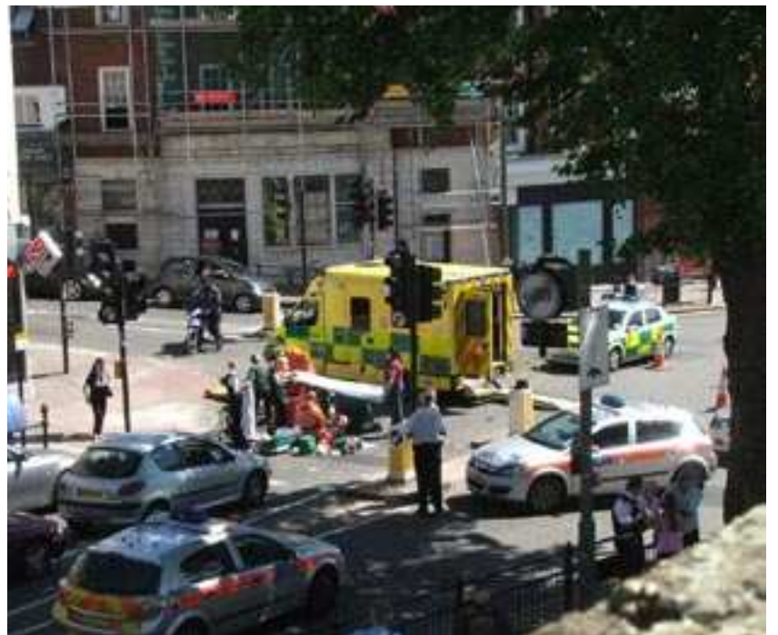
Emergency services were called to the scene of an accident in the centre of East Finchley.

A decision on whether East Finchley Library will be granted lottery funds is expected in October.