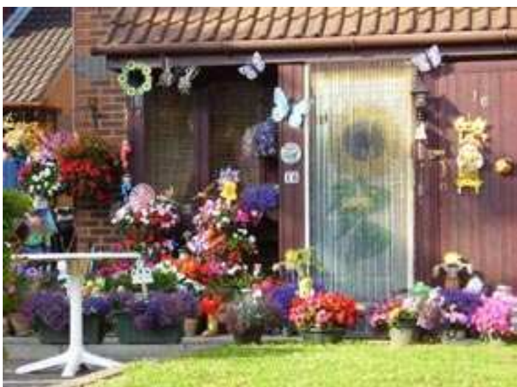
Pauline Moran's garden.