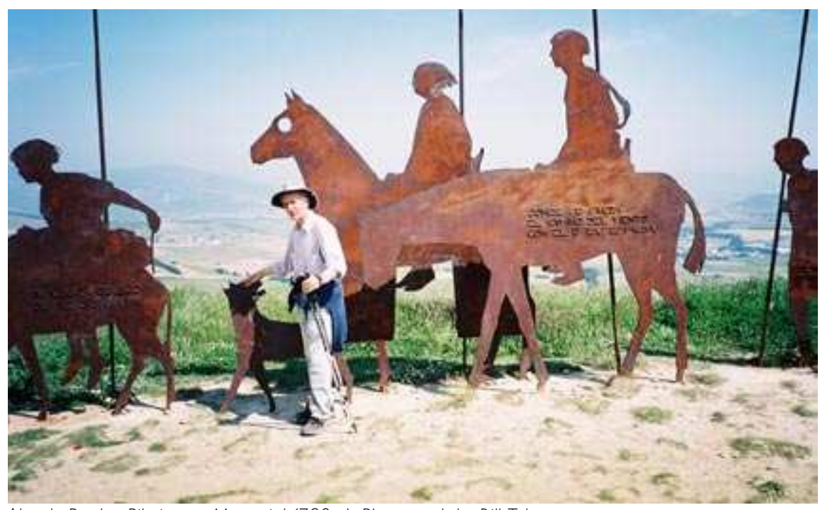
Alto de Perdon Pilgrimage Memorial (790m).