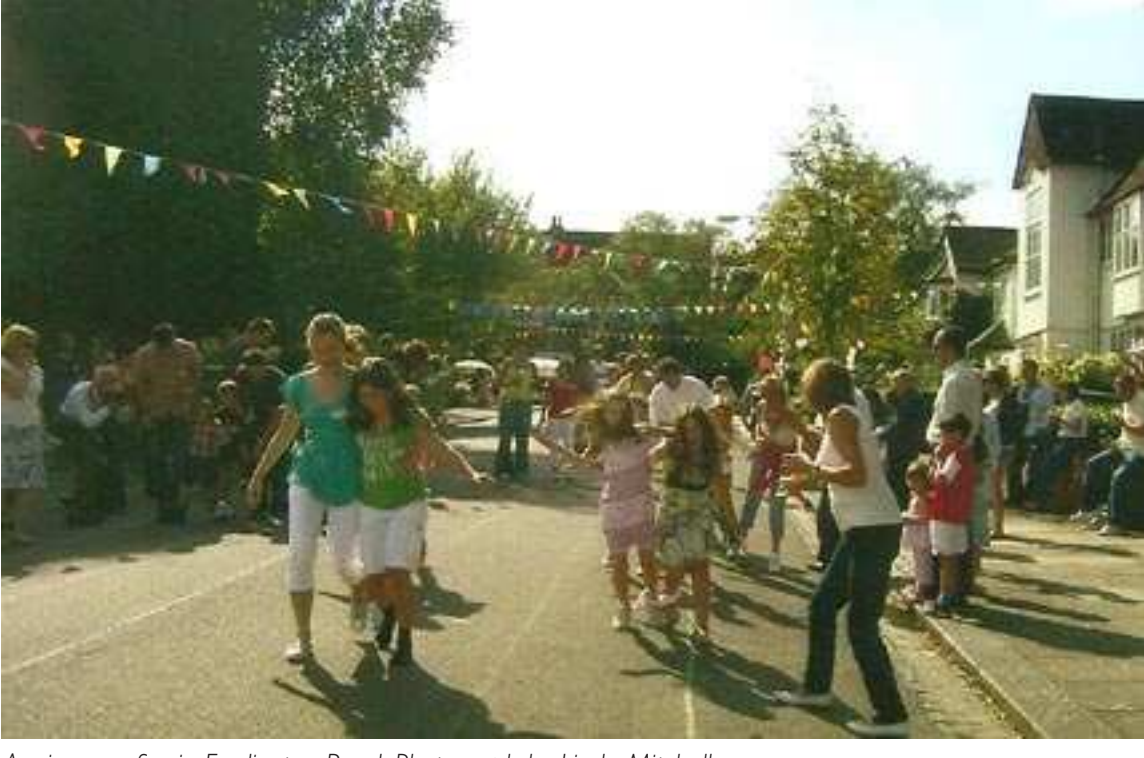
Anniversary fun in Fordington Road.

Combat-related psychological injuries can also have a huge impact on families, friends and carers. Combat Stress would like to do more to support these often unrecognised victims, as well as to continue its lifelong commitment to clients. For all this it needs funding. To help or to have more details contact Combat Stress at Tyrwhitt House, Oaklawn Road, Leatherhead, Surrey KT22 0BX, telephone 01372 841619 or visit www.combatstress.org.uk.