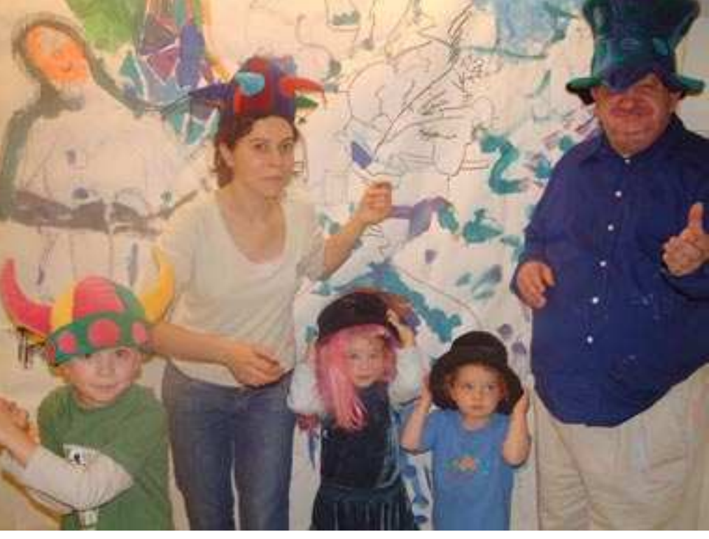
The Big Draw at Community Focus

Stall hire is £20 with all proceeds going to East Finchley Neighbourhood Contact. For further information or to reserve your space please contact Sian or Tareshia on 8444 1162.