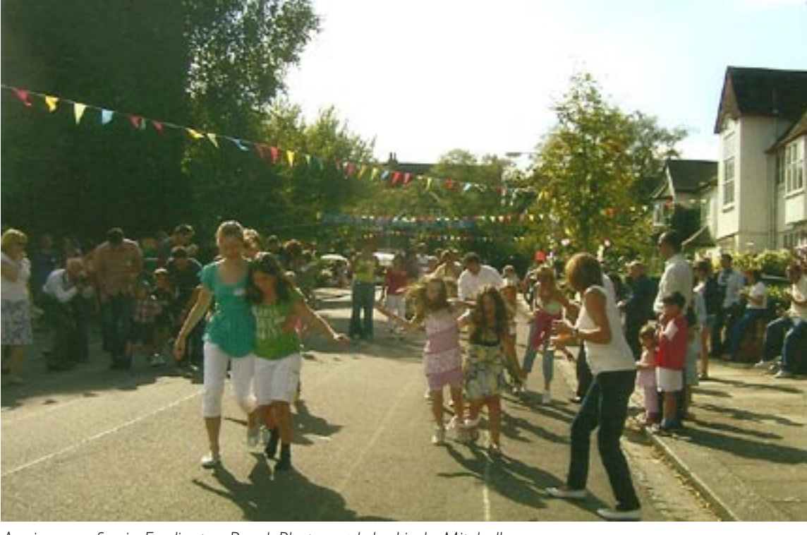
Anniversary fun in Fordington Road.

Combat-related psychological injuries can also have a huge impact on families, friends and carers. Combat Stress would like to do more to support these often unrecognised victims, as well as to continue its lifelong commitment to clients. For all this it needs funding. To help or to have more details contact Combat Stress at Tyrwhitt House, Oaklawn Road, Leatherhead, Surrey KT22 0BX, telephone 01372 841619 or visit www.combatstress.org.uk.