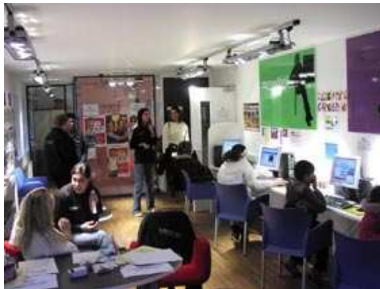
Inside the new extension at The Old Barn.

English Heritage has set up an online petition for those who support the concerts and would like to see them return. It can be found at www.petitiononline.com/Kenwood .