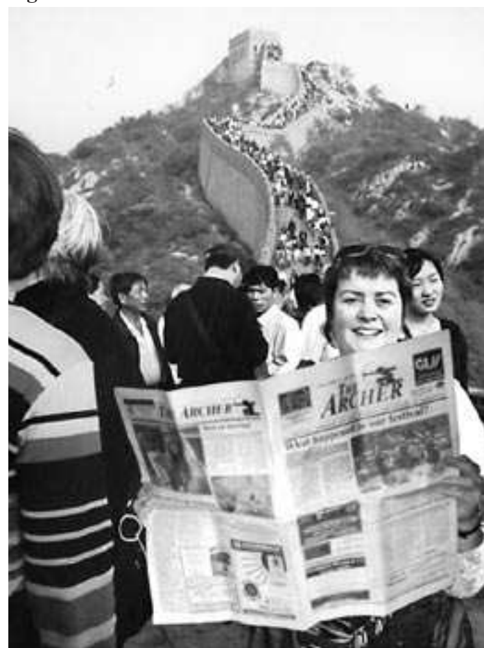
Seen on the Great Wall of China, Photo by Sheila Armstrong

Evening entertainment is the Peking Opera, the world-famous Shanghai Acrobats and jazz in the bar in the Peace Hotel on The