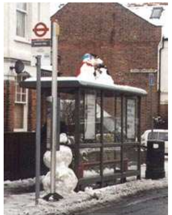
"I absolutely froze waiting for that 143 bus!"