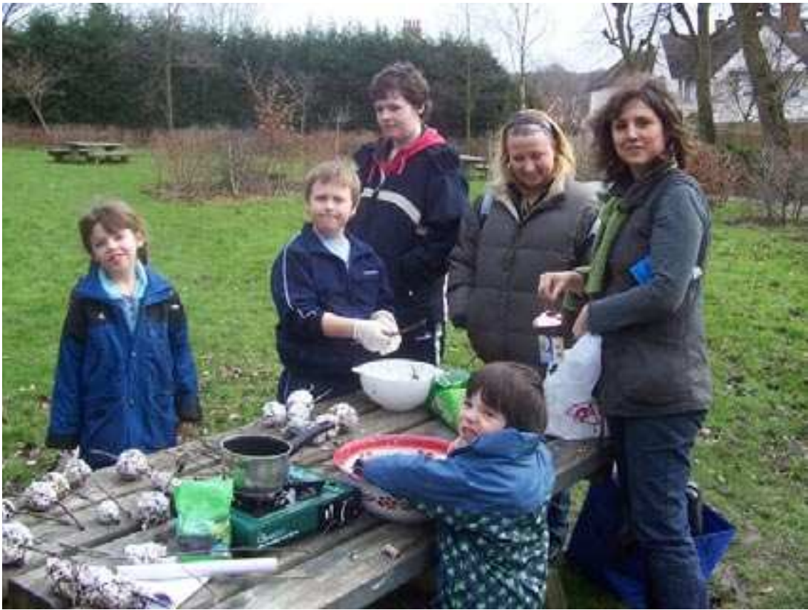
Making food balls for the birds.