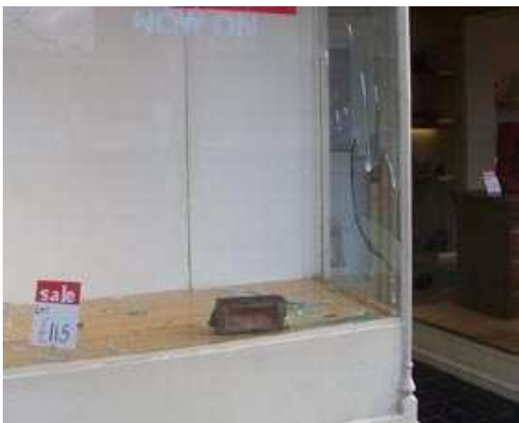
The brick that did the breaking.

The open afternoon takes place at the school in High Road on Tuesday 13 March from 1.30-3.30pm, with the first of five tours starting at 1.30pm.