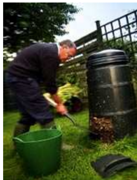
Composted waste will feed your garden this spring.

For a free copy of Composting: An Easy Household Guide contact Barnet Council's recycling team on 020 8359 7400 or email recycling@barnet.gov.uk .