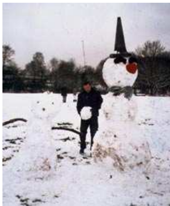
Giant snowmen in Cherry Tree Woods.