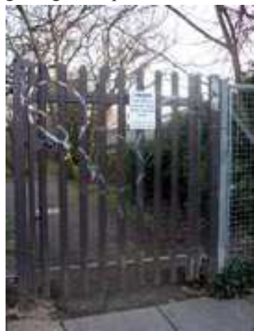
If you go down to the Wood today you're sure of a big surprise...

According to Barnet's Greenspaces, the security company responsible for opening the gates had been told that a road traffic accident in East Finchley would prevent them getting to the park and were not