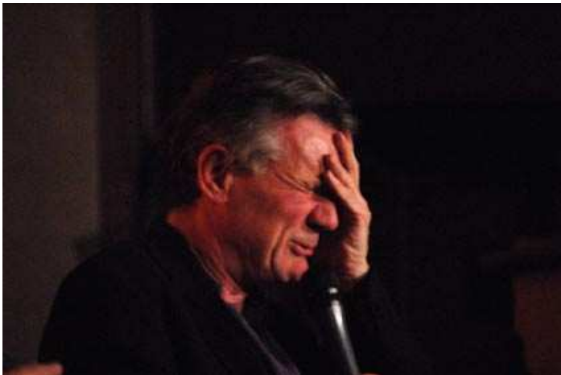
Michael Palin at the Phoenix.