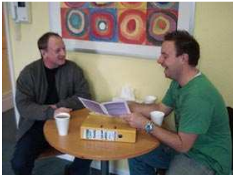
A staff member and client at The Crossing.

Clients can be referred, but most are self-referred. The Crossing offers a drop-in service, one-one and group support, including help with problems and projects, techniques against relapse, counselling and goal-oriented services, complementary therapies and