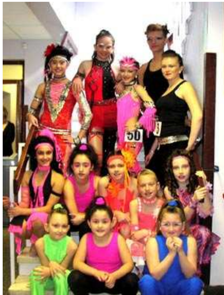
Footloose Dance Group.