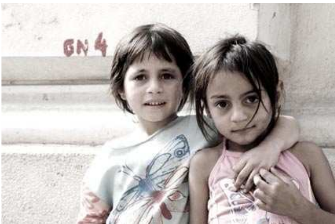
The street children of Bucharest desperately need the support a day centre can offer.