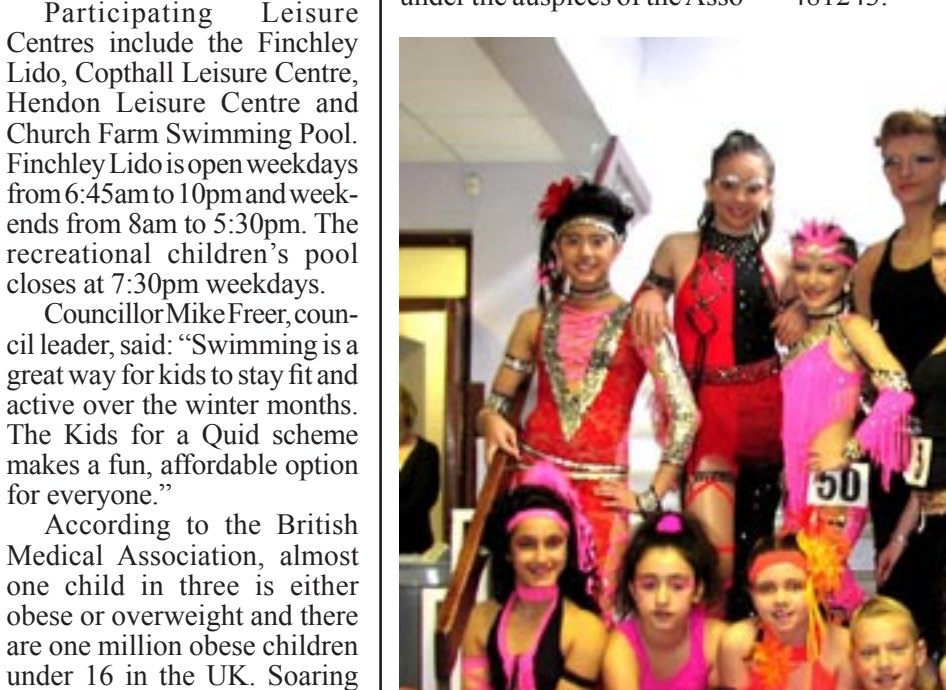
Footloose Dance Group.