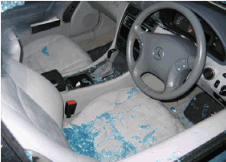
A thief smashed the window of this car in East Finchley and snatched the satellite navigation system.