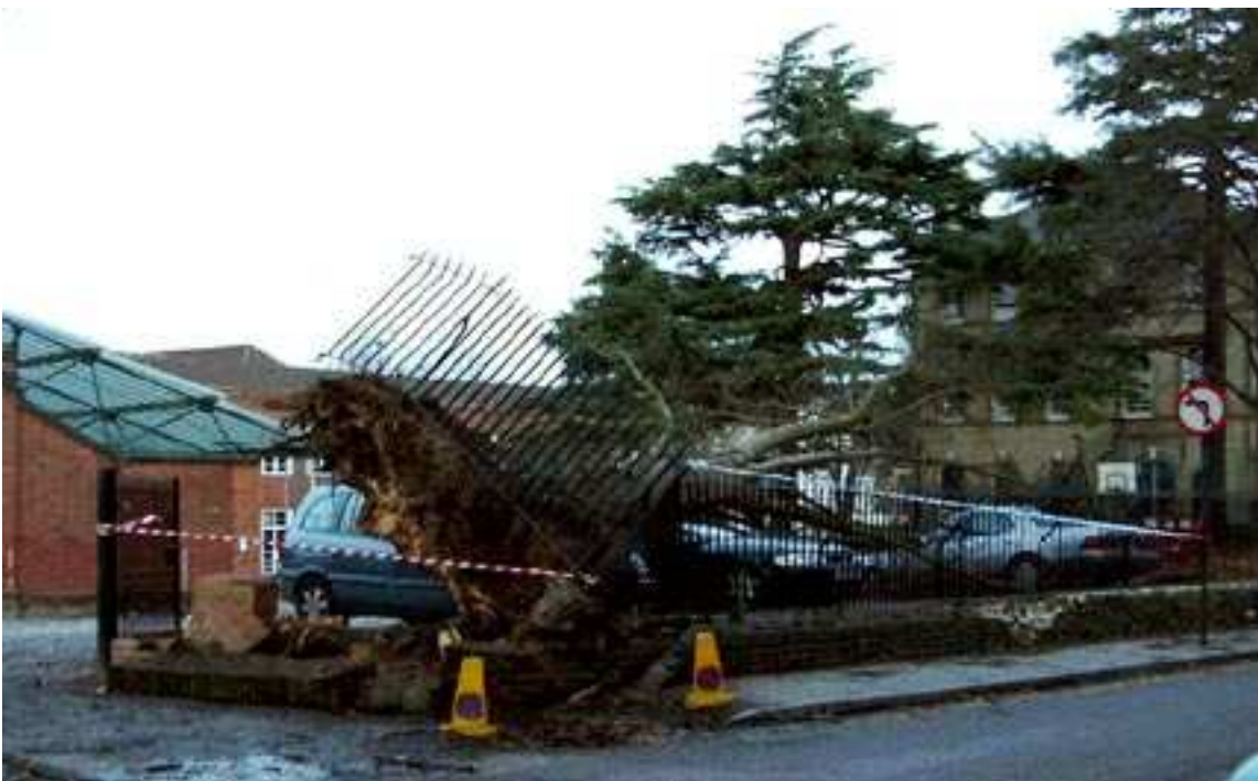
Destruction at Highgate School.

A community newspaper for East Finchley run entirely by volunteers.