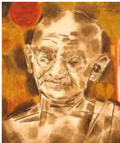
Alphonso Doss - 'Melting Sun (Gandhi)' (2006), oil on canvas.

CF John deals with what is believably real for the human form, what is possible for a body under force, and what happens when a human subject's three-dimensional action is transformed into a two-dimensional image. He has collaborated with an American performance artist.