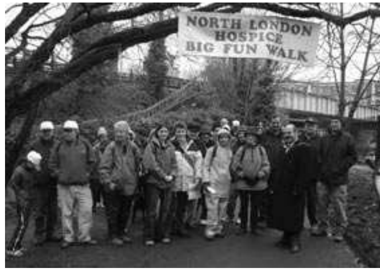
Walkers at the start of the 2004 Big Fun Walk.