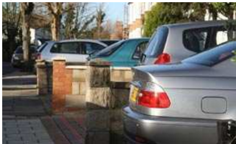
Getting permission to park your car in your front garden, like these in East Finchley, is about to get easier