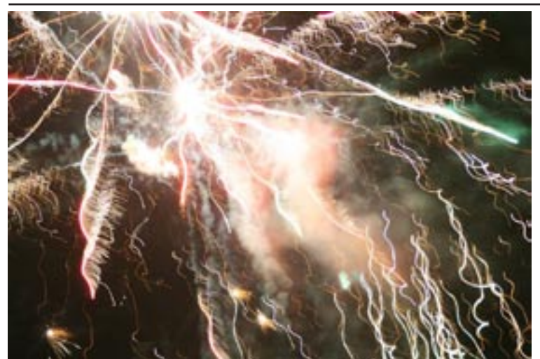
Fireworks at the display at Martin Primary School last month, supported by the Finchley Development Trust.

Then there are the flies. Anyone seen my fly net? Oh, what have we done?