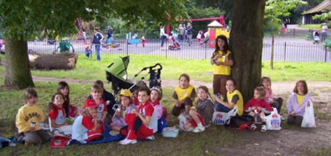
Brownies and Rainbows enjoying their picnic.