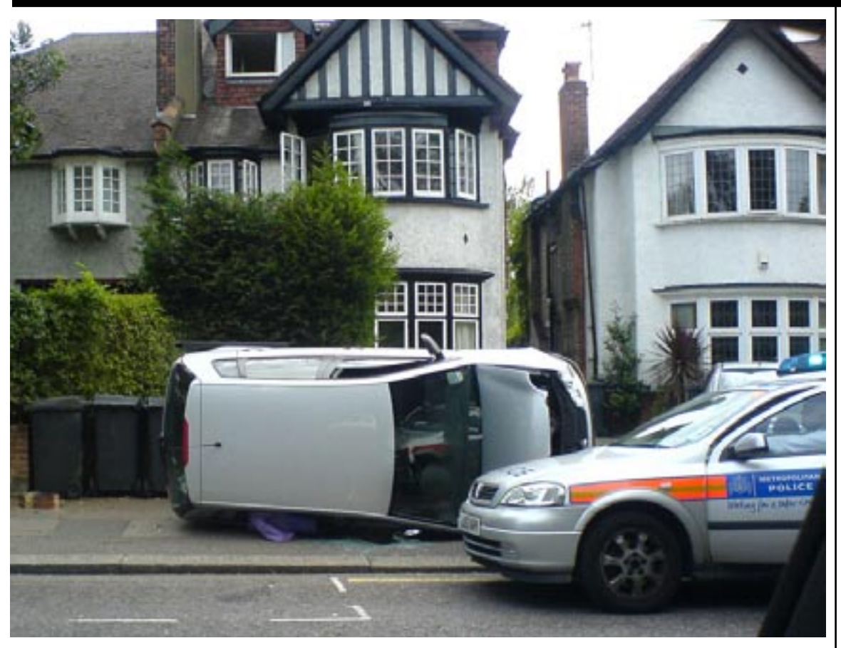
"You'll have to get out my side"

community newspaper for East Finchley run entirely by volunteers.