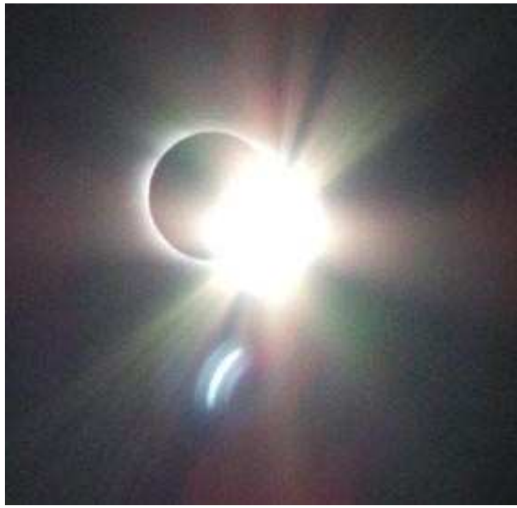
Totality ends with the glorious diamond ring effect.

A partial eclipse of the sun is an interesting distraction, but a total eclipse is another matter... the sun's disc is completely covered, the sky darkens, the temperature drops and the spectacle of the corona and the prominences can be seen, ending with the glorious diamond ring effect. However, to see it, one must be in exactly the right place at the right time, with a clear sky.