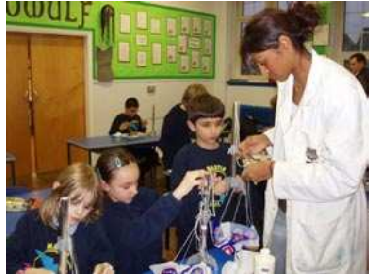
Budding astronauts at Martin School.