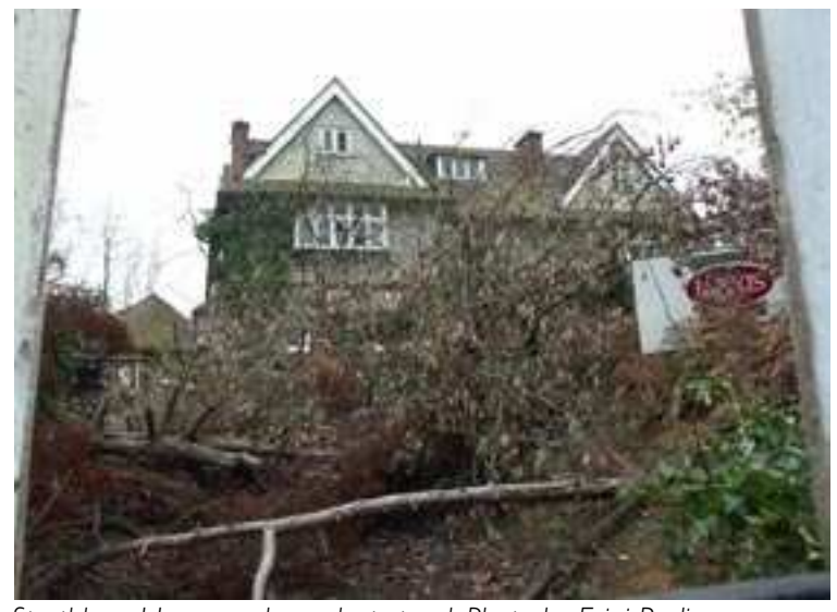
Strathlene House makes a last stand.

Last year, the developers began felling mature trees and were restrained only by swift local action ( THE ARCHER February 2005). The new application contains no explanation or apology for that tree-felling so residents are anxious for the safety of the remaining trees.