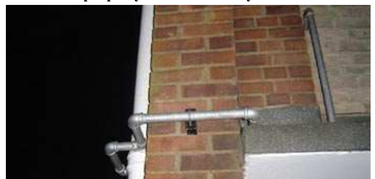
The new gas pipes attached to homes in Park Farm Close.

First-time buyer Melanie Bruck could hardly believe her eyes when workmen began replacing gas supply pipes around her property in East Finchley.