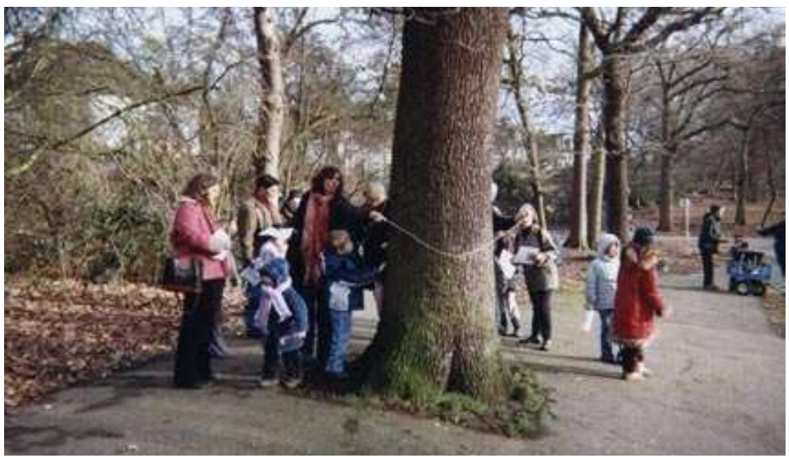
Just getting the measure of it.

And if you are wondering which is the oldest tree in the wood, it's the oak tree just off the path towards the café: estimated age 280 years.