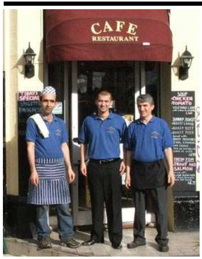
Local Cafe staff are waiting to feed you!

A community newspaper for East Finchley run entirely by volunteers.