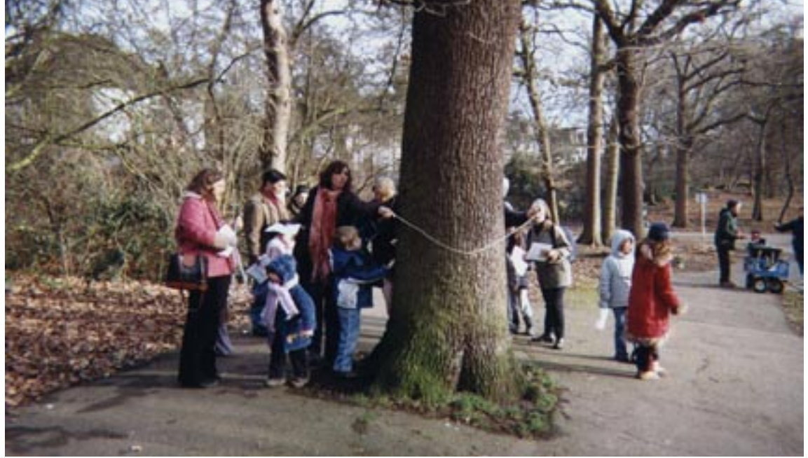
Just getting the measure of it.

And if you are wondering which is the oldest tree in the wood, it's the oak tree just off the path towards the café: estimated age 280 years.