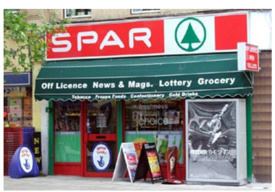
Targeted: the Spar shop in the High Road.

Anyone who saw something suspicious in the area at the time, or has any information regarding the robbery is asked to call the Flying Squad on 020 8358 1751 or call Crimestoppers anonymously on 0800 555 111.