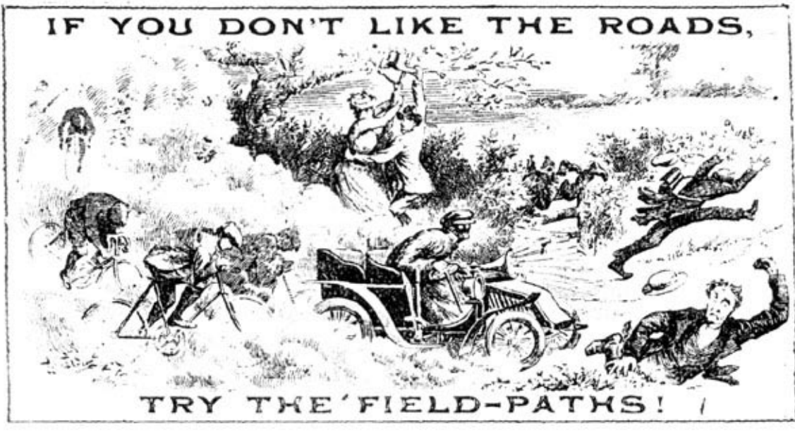
Even in 1896, the roads were a hazardous place - an illustration from the book

"This leads through an old-fashioned district known as Finchley Market, where, in front of the post-office, the main-road narrows very considerably, while a broad road turns off to the right. This latter is to be followed. It soon turns to the left, then sharply to the right, and leads into the North Road, when turn to the left." (This seems to describe the walk up Market Place, past the Royal Mail sorting office and then the twists and turns of Park Road before it joins the High Road).