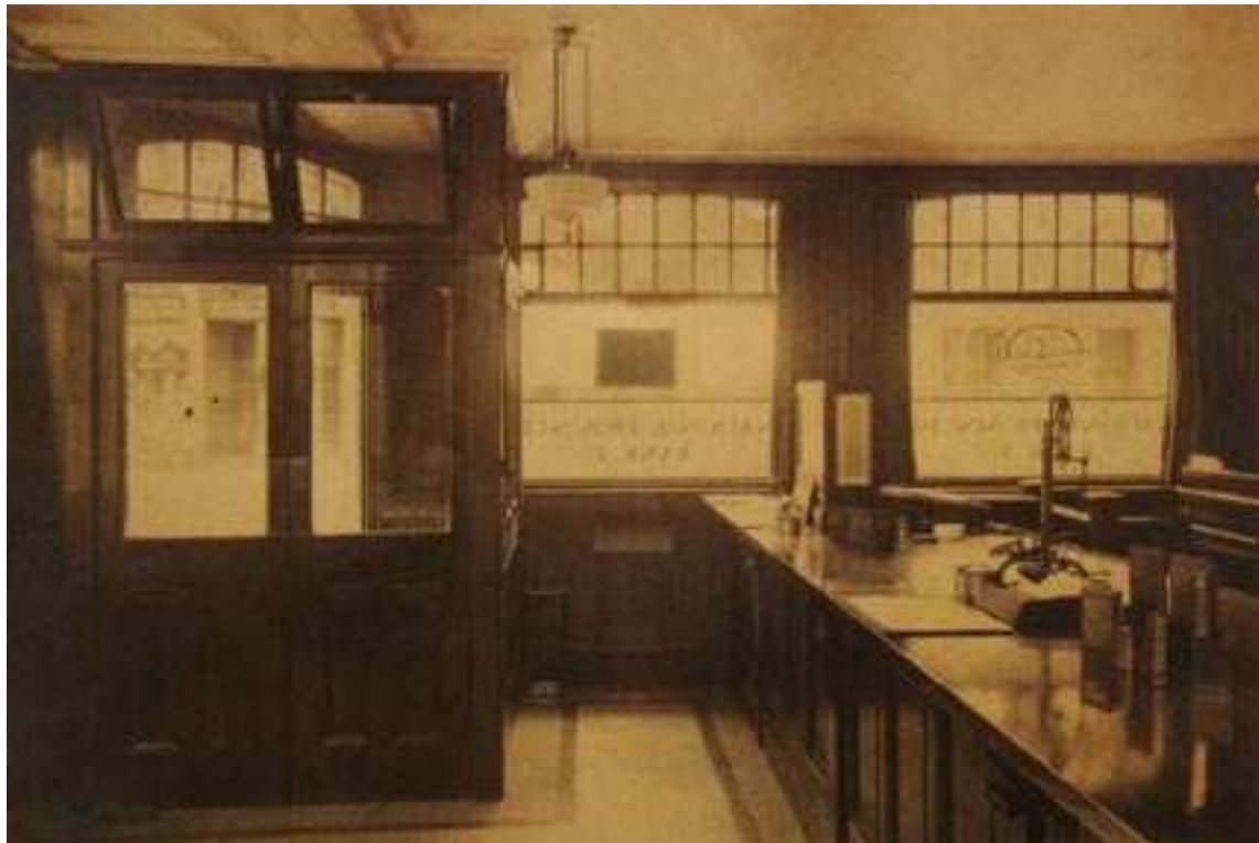
The High Road banking hall as National Provincial customers would have seen it in the 1930s.