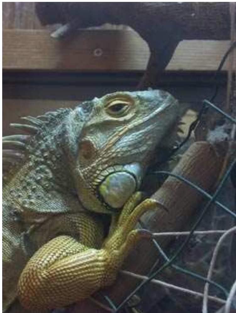
Arnold 2 the iguana, awaits a new home.