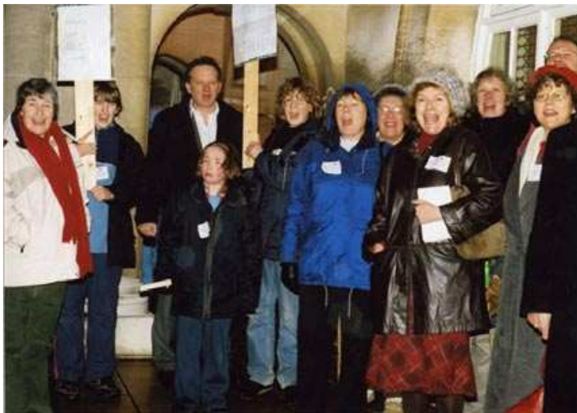
Protesters make themselves heard outside the library.

See page 3 for how your journey will be affected