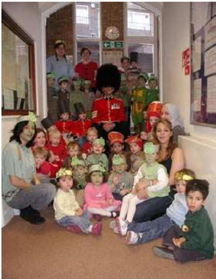
Soldiers, currant buns, speckled frogs, little stars and staff pose for the camera at Scribbles.