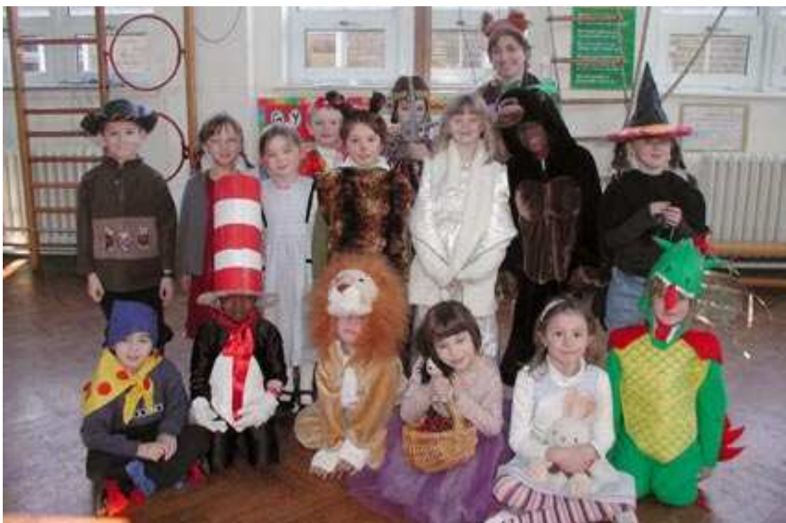
Hagrid, Harry Potter, Captain Underpants and a spaceman line up for World Book Day.

When Cinderella left she forgot to take one of her shoes but the Prince married Cinderella and they lived together.