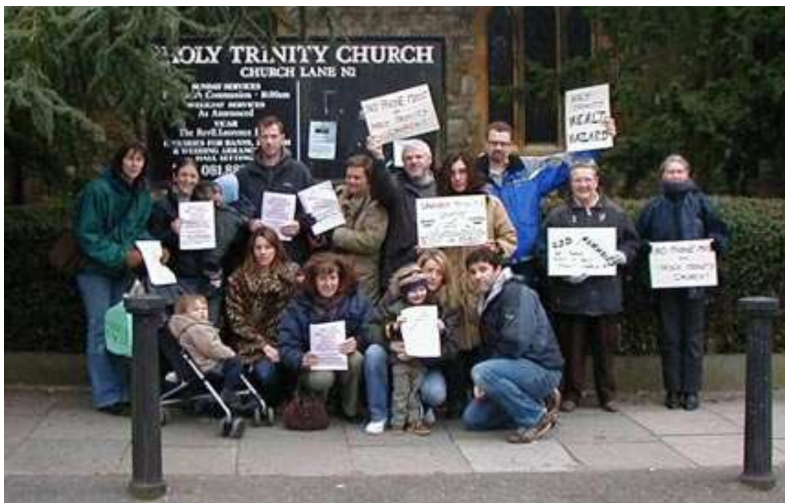
Campaigners staged a demonstration outside Holy Trinity Church to protest at the plan to install mobile phone masts.

Opposition councillors called for more leisure and cultural activities for young people, one speaker drawing attention to the Council's plan for children and young people for the years 2006-2009. In its 23 pages, he said, sport was mentioned twice, and was not mentioned at all in the section on obesity.