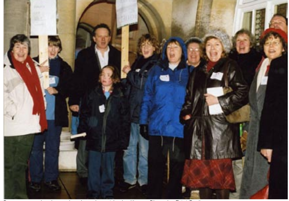
Protesters make themselves heard outside the library.