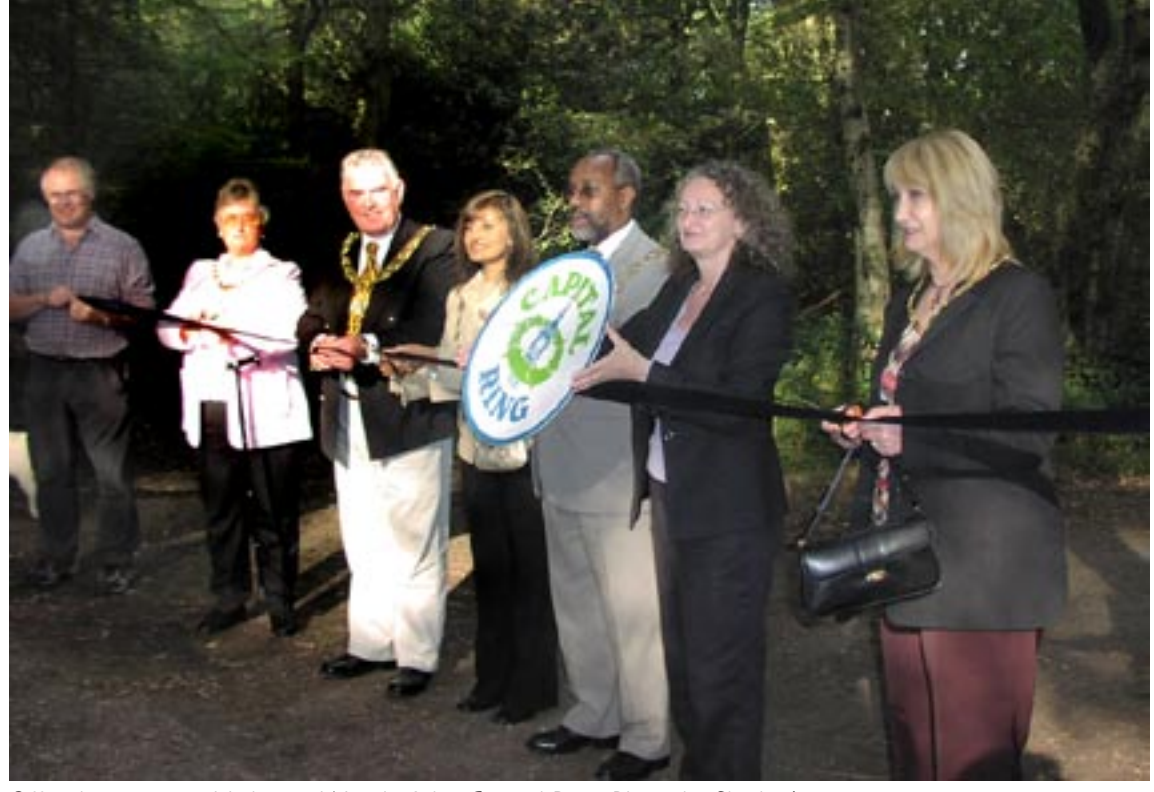
Official opening in Highgate Wood of the Capital Ring.

This is a golden opportunity to hear this amazing blind Singer/Songwriter in Concert Sunday 13th November - 11:00am The Finchley Youth Theatre 142 High Road, East Finchley, London N2