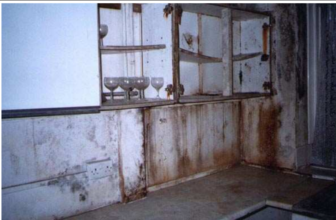
After the Deluge.

on the day, but signing up beforehand makes the start much less chaotic. You can apply for a registration form by phone on 020 8202 5586, or do the whole thing online at www.bigfunwalk.co.uk . The Hospice gains maximum benefit if you tick the Gift Aid box on the form. Claiming sponsorship money under the Gift Aid umbrella brought the Hospice an extra £10,000 last year.