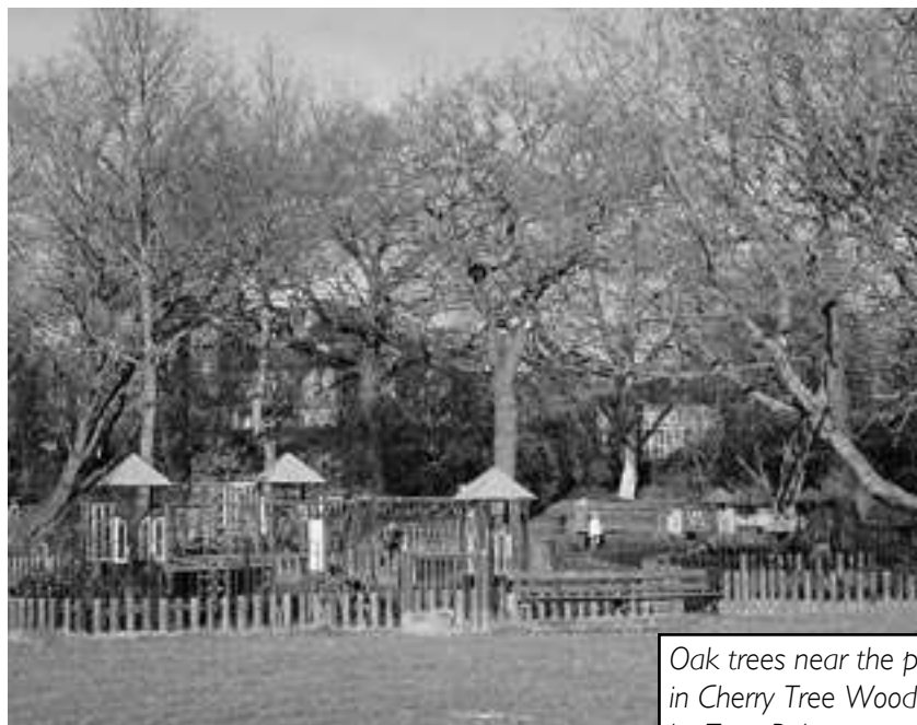
Oak trees near the playground in Cherry Tree Wood.

To avoid further danger to the public, Barnet Council is proposing to cut down some of the oak trees that overhang the children's playground in Cherry Tree Wood. This is because a large bough broke off and fell across part of the play area last Autumn. It seems obvious that any such work should be completed before the planned improvements to the play park begin, which should be in April.