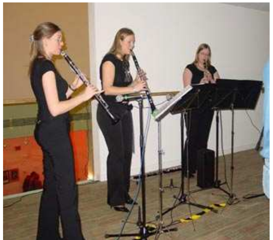
OPUS 4 performing in the foyer during the interval.