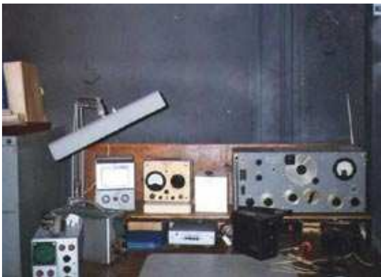
Vintage radios in the former BBC studios at Alexandra Palace.