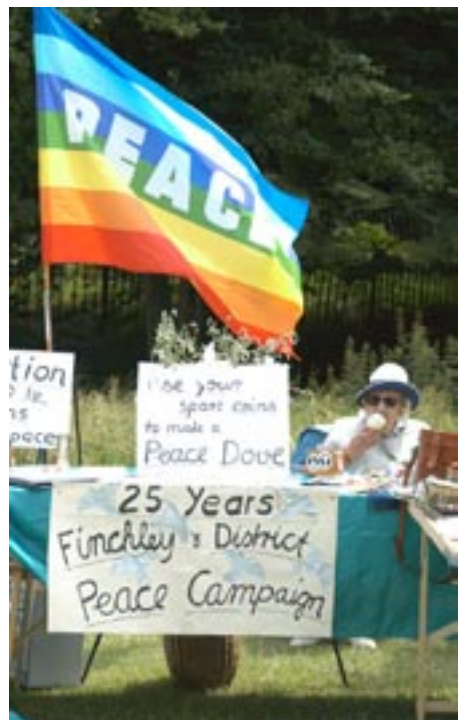
Love, peace and ice-cream.