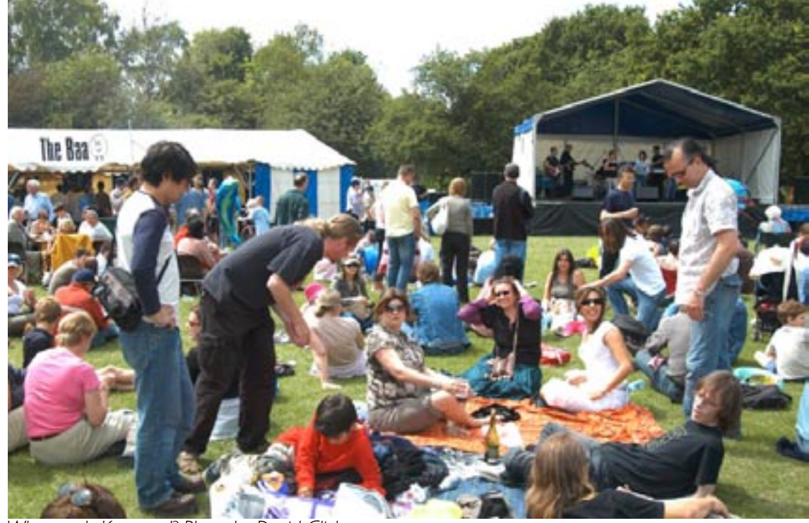
Who needs Kenwood?

http://www.allsaints-eastfinchley.org.uk