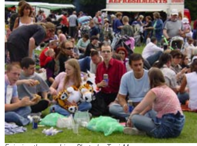
Enjoying the sunshine.

8 Cyprus 9 South Africa 10 Peru (Machu Picchu)