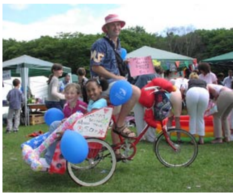
Martin Schools' Guided Tour.