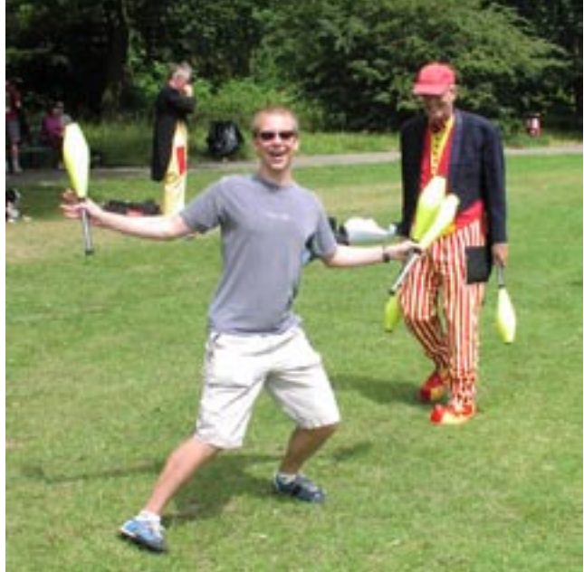
Jugglers