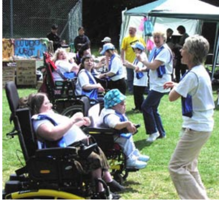
Happy-Go-Lucky Dancers.

Here, THE ARCHER brings you the best pictures from the festival to capture the magic of the day. Congratulations once again to all the organisers and volunteers who made the event such a success.