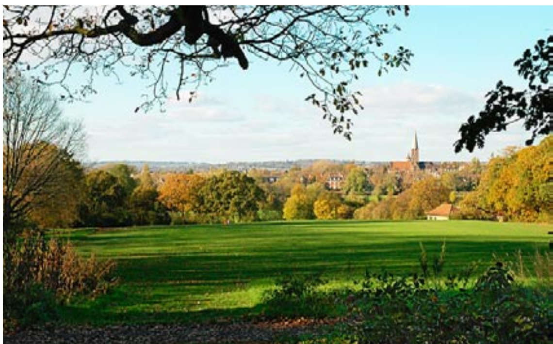
The Heath - looking towards Finchley.

For two successive years the Heath's budget has been exceeded. Money from the Open Spaces Directorate, which manages the Corporation's seven open spaces, has bailed out earlier shortfalls. To avert an estimated overspend of £330,000 for 2005-6, cost cutting seems inevitable. Measures proposed include cancellation of concerts in