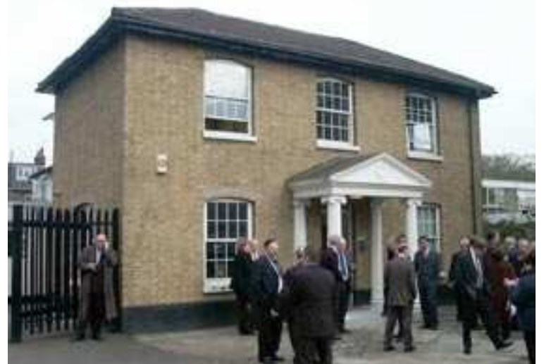
GLH House today (above) and (below) a map from the 1860s centred upon the GLH building, reproduced by kind permission of Ordnance Survey and LB Barnet.

The rear extension was destroyed by fire in the 1980s and rebuilt. The front part of the house was unaffected. The recently-added portico at the front, therefore, masks what is one of the few surviving buildings from the earliest days of East Finchley.