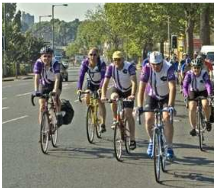
Sunny Sunday cycling - the bike ride gets underway on the High Road.

Please contact Maggie on 020 8440 1558 for details.