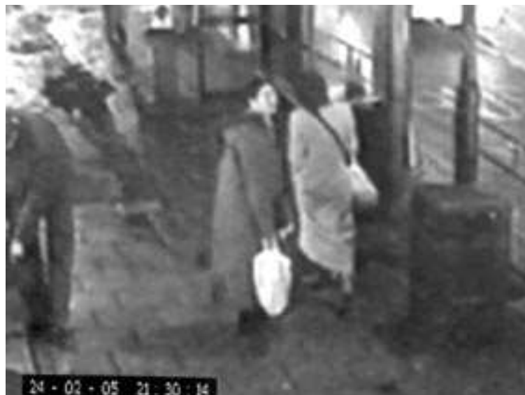
The woman about to board a bus in Golders Green Road, the previous evening.

She had only been in the country a matter of days and had been working in a medical centre in Golders Green. They believe that her family, including her six-year-old daughter, are in China.