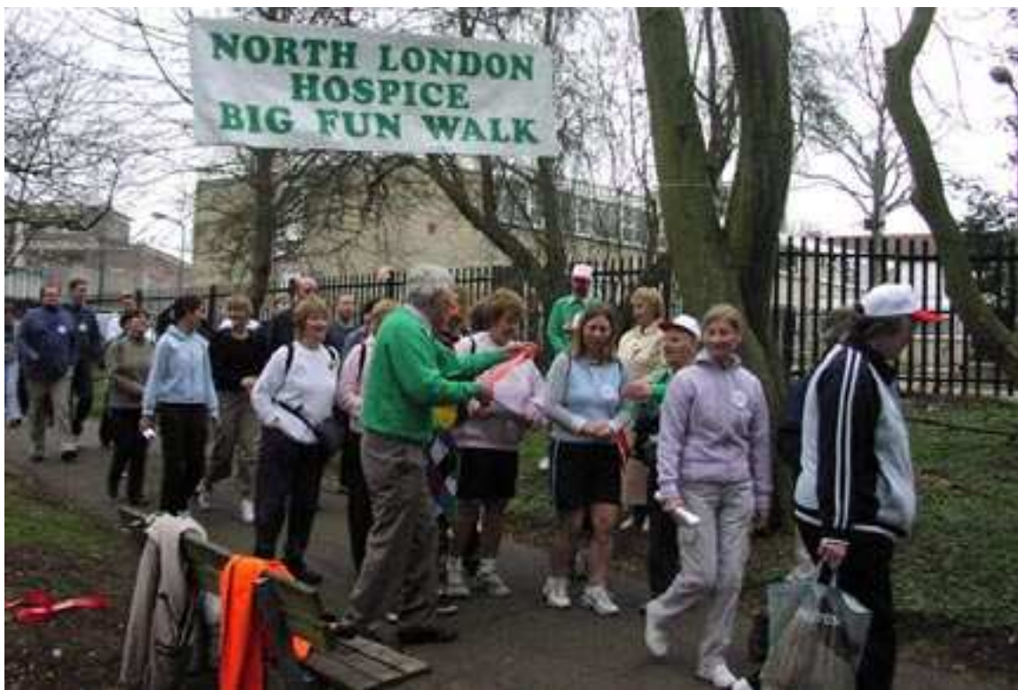
The Big Fun walkers set off on the route in Cherry Tree Wood.

A community newspaper for East Finchley run entirely by volunteers.