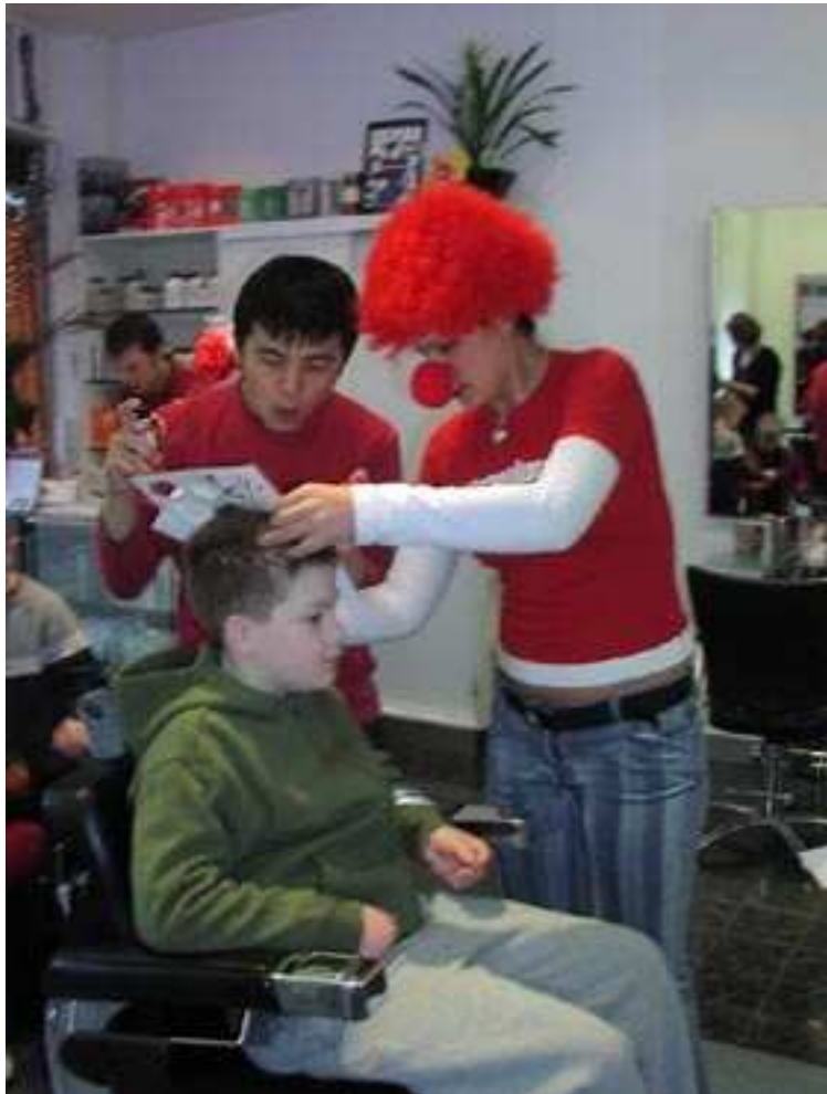
202 staff hard at work.

On a very cold day, staff took it in turns to stand outside with a collection bucket, so let's hope that the bear outfit kept