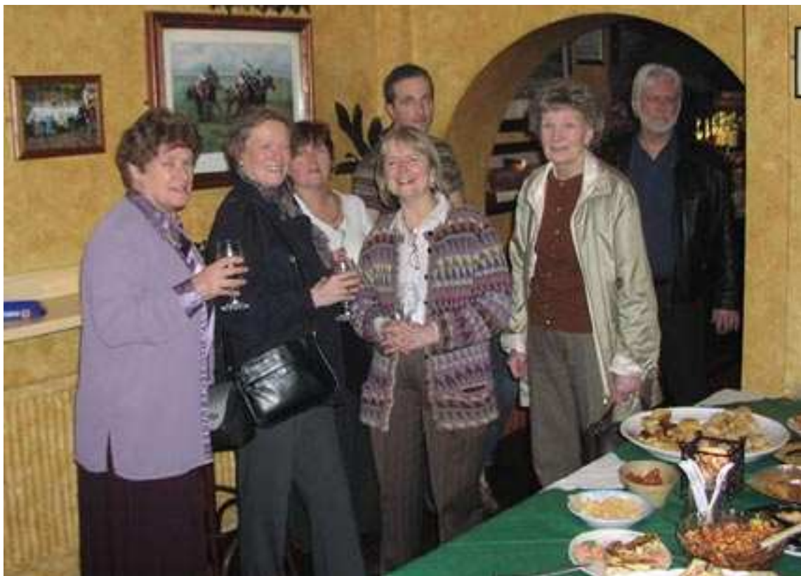
The Archer says thanks to all our distributors.