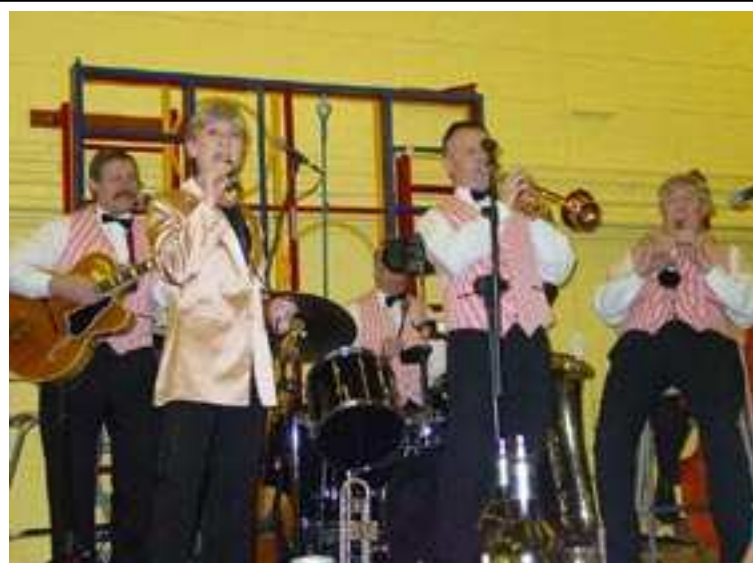
'Just the Job' jazz band.