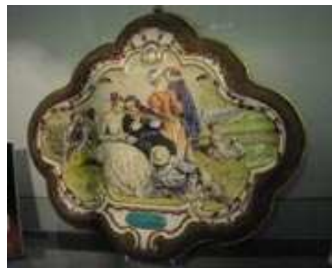
Ceramic with design based on picture by Emile Lessore, c.1870.

Documents, prints and photographs are used to tell the story of this remarkable pottery, from the 1750s, when fashionable people clamoured to be the first to have Mr Wedgwood's wares