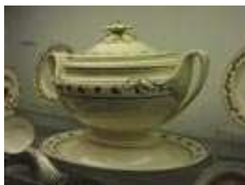
Creamware Soup Tureen, circa 1800.

To mark its 50th anniversary, the society has compiled an exhibition showing specific aspects of Wedgwood which have been studied and researched by its members over the past half-century. Emphasis is given to the designers (such as Arnold Machin-Taurus and