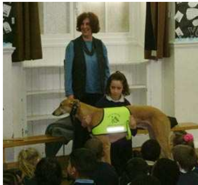
A pupil at Martin Junior School helps to demonstrate the Pets as Therapy Temperament Test.

Sam, my Greyhound, and I attended an assembly at Martin Junior School in East Finchley in order to demonstrate the Pets as Therapy Temperament Test. PAT is a charity which takes dogs and cats to visit sick or lonely people to help them feel better. The test is designed to ensure that only gentle, good tempered dogs become PAT dogs. When a dog has passed the test, the charity insures it for visits to hospitals, schools or residential homes etc.