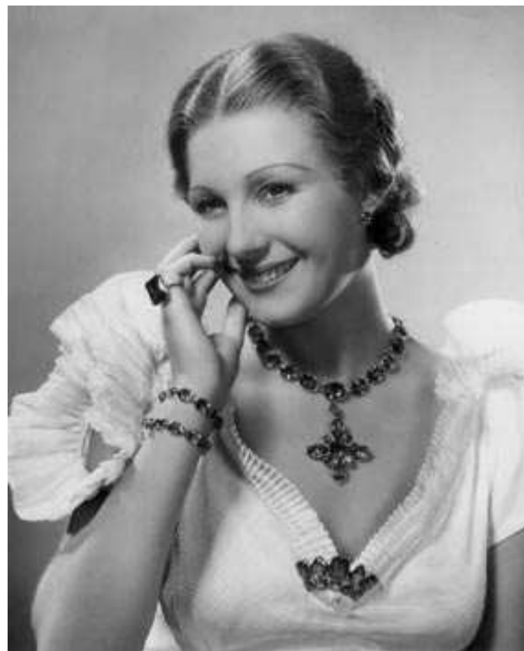
Binnie Barnes.

Medical secretary/receptionist required 35-40 hours a week by physiotherapy practice N2. Job share considered. Must be computer literate with fast audio typing speed, Microsoft Office. Training will be provided for use of database. Send CV and covering letter to: Wendy Longworth, East Finchley Clinic, 3 Bedford Mews, Bedford Road, London, N2 9DF