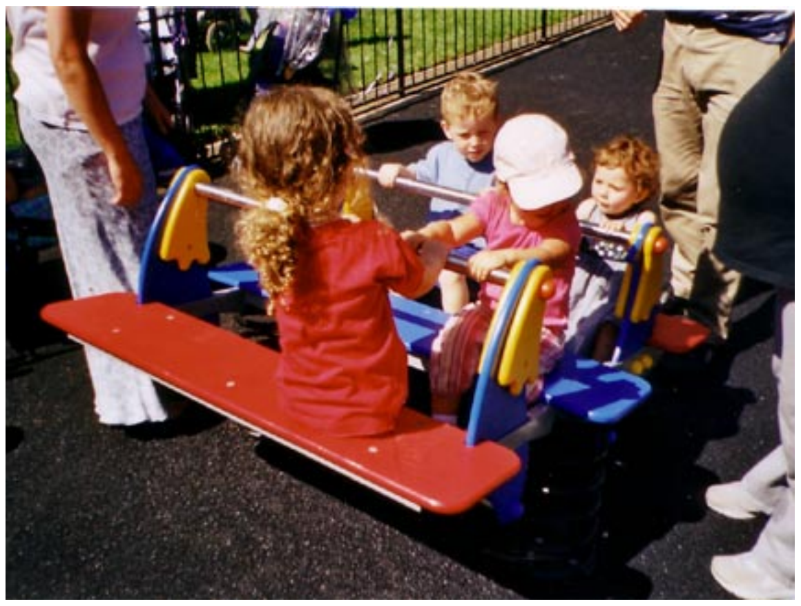
Children enjoying the new Avenue House playground.