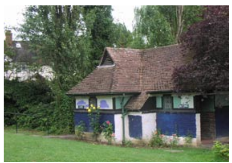
This should be more convenient for all park users next year.

The safety of park users will also be a priority, so all park keepers and ground maintenance staff will be regularly and clearly visible in their uniforms and will have received customer care training. Vandalism and anti-social behaviour will be monitored and, where