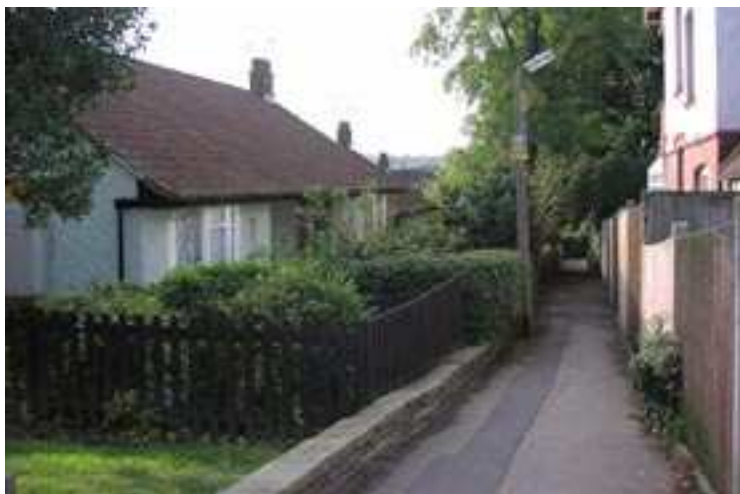
The alleyway at Buckden Close.

Anybody with any information on the whereabouts of the horses should call 020 8733 5875. Alternatively if you wish to remain anonymous call Crimestoppers on 0800 555 111.