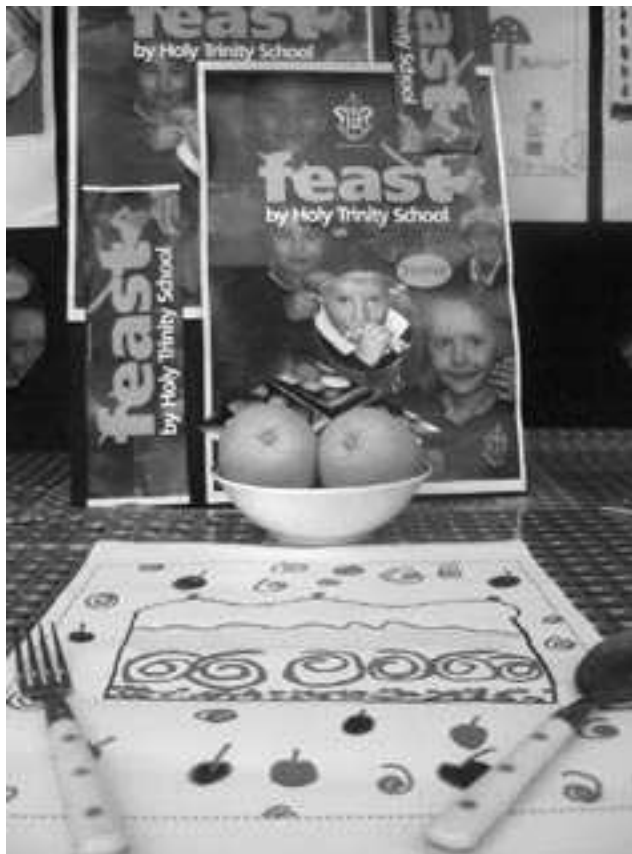
As displayed in Muswell Hill Bookshop.