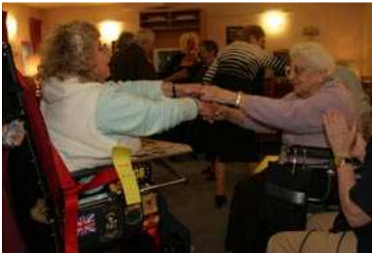
Hands of friendship at Fairacres Monday Club