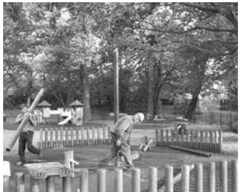
Men at work in the playground.

You can also contact the Friends of Cherry Tree Wood at info@cherrytreewood.co.uk or write to them ASAP with your comments via The Archer (Cherry Tree Wood), PO Box 3699, London N2 8JA