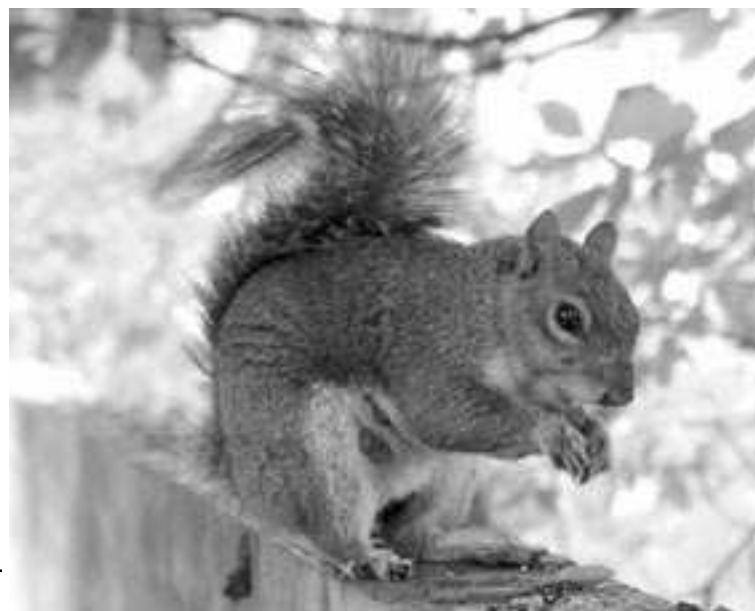
Preparing for winter.