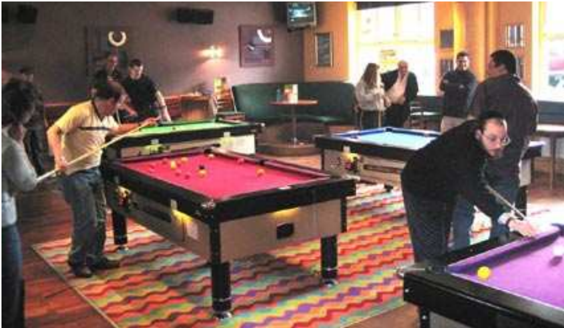
COPs members enjoy a pool tournament at The Bald Faced Stag.