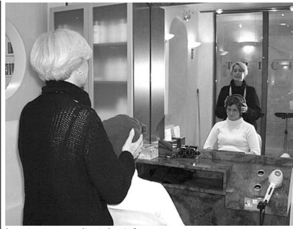
Beauty therapy in action.