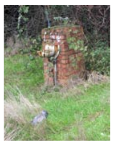
The fountain that never was.