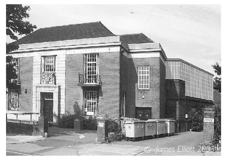
Front view of the library showing proposed extension taken from James Elliott's extension proposals